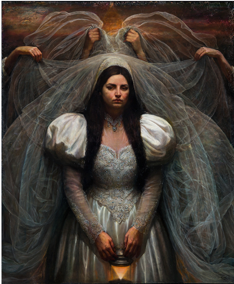
"Bride with Lantern" by Steven Assael, 2015. Oil on canvas, 72 x 60 inches. © Steven Assael, Courtesy of Forum Gallery, New York.

Typical to a point, the bride steps out of character with an odd sideways look, characterized by a deadpan stare that lies somewhere between resignation and a scowl that would prevent a pick-up line from ever leaving the safety of a suitor's lips, and, worse, chill the will of a nervous groom.