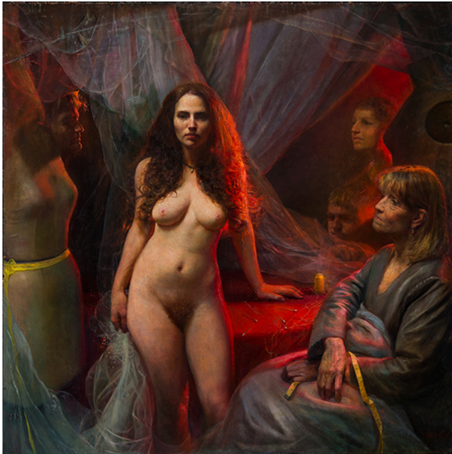
"Bridal Preparation" by Steven Assael, 2015. Oil on canvas, 68 x 68 inches. © Steven Assael, Courtesy of Forum Gallery, New York.

Symbols abound: a measuring tape, a mannequin, dressmaker pins pointing ominously to the exposed flesh of the bride. The seated older woman folds her arms across a gathering of cloth on her lap, an intimation perhaps of her womb, with a measuring tape entwined in her hands. Indicative of complex thoughts and feelings upon seeing a daughter prepare for marriage, the work is both poignant and restrained.