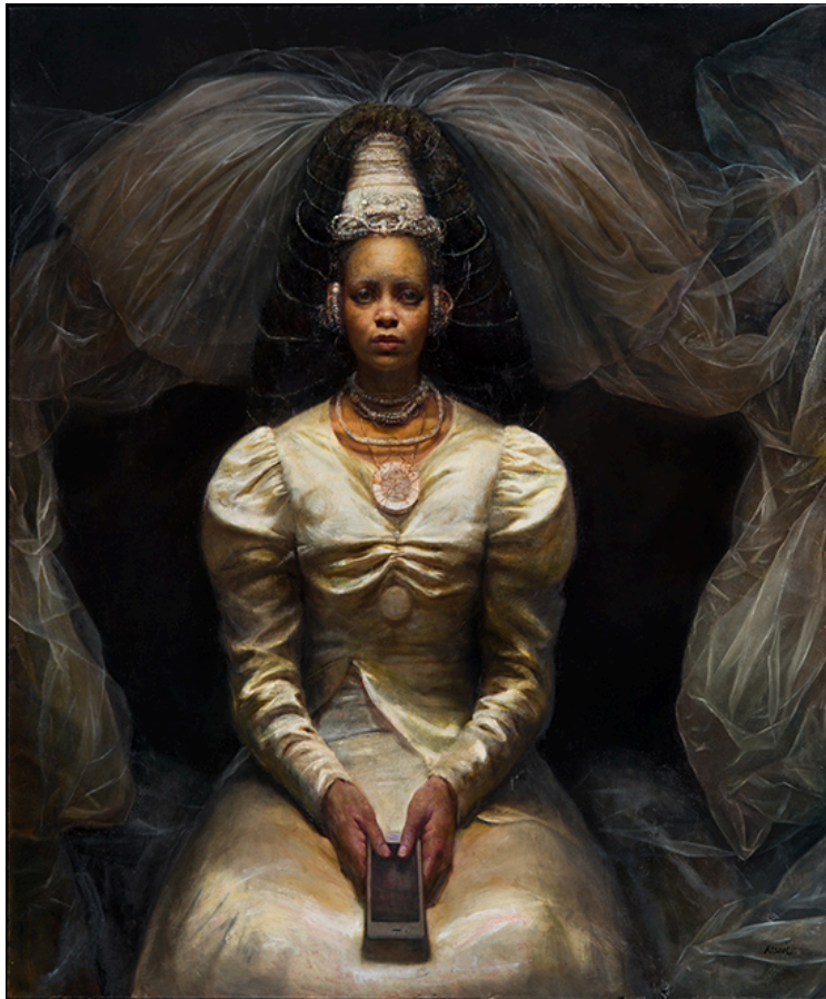
"Apiim" by Steven Assael, 2015. Oil on canvas, 72 x 60 inches. © Steven Assael, Courtesy of Forum Gallery, New York.

Bridal Preparation is more overtly allegorical. In it a disinterested figure of a nude young woman stands and faces the viewer as an older woman sits across from her at an angle. Both are apparently participating in a gown-fitting session, with a few unexplained heads looking on from behind. Unlike a straightforward illustration of a group event, the action has paused and the figures hold their pose, assumingly for the benefit of the viewer, though there is little evidence of their being aware of onlookers.