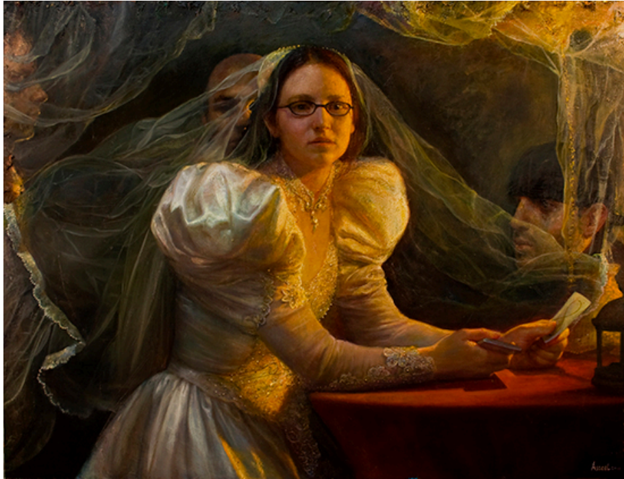
"Bride with Cards" by Steven Assael, 2011. oil on canvas, 36 3/8 x 48 inches.

The theme of Assael's current solo show at Forum Gallery is the bride, a subject of universal familiarity and one he avoids steering with the usual nods and winks in the direction of Duchamp's tired old conjugal witticisms. Instead viewers get a highly personal vision in the form of rather unsettling bridal portraits. Based on a common though culturally loaded image, there is a teasingly ambiguous tone to what initially appears to be a strictly unified series.