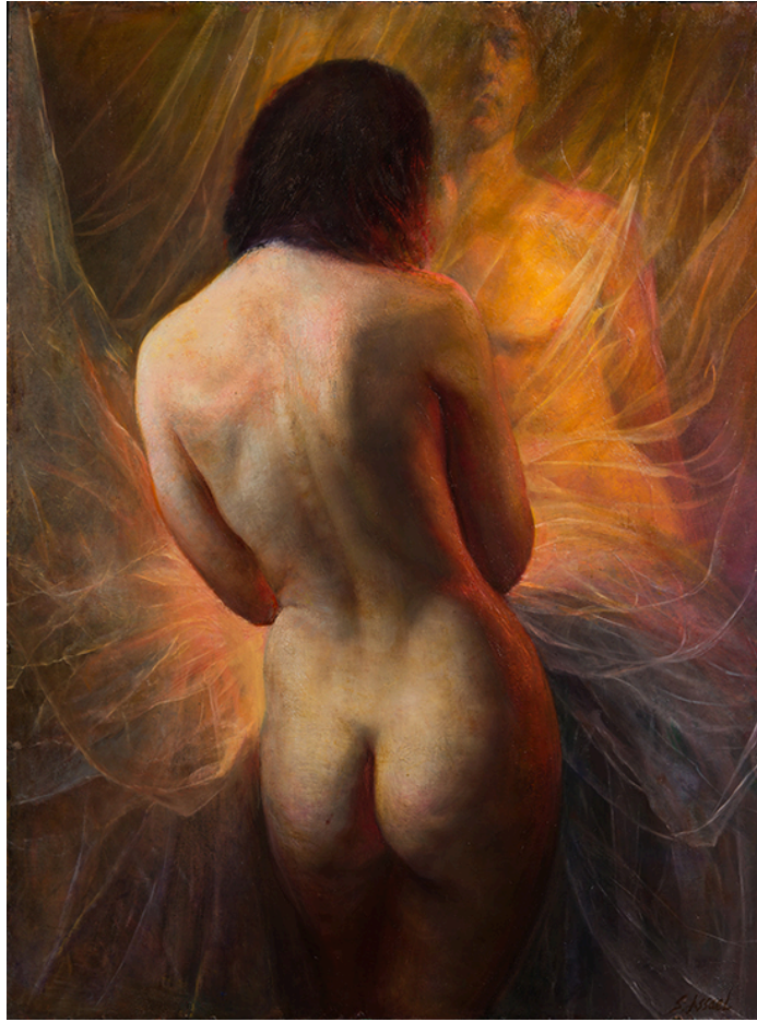
"In Front and Behind the Veil" by Steven Assael, 2014. Oil on canvas, 48 x 36 inches.

Bride with a Lantern is a frontal image of an ambivalent looking young woman, suffering, one might say, the formal swathe of a white bridal gown and surrounded by an elaborate veil held aloft by arms and hands of otherwise invisible helpers. The veil motif appears in many of the canvases, the texture of which Assael executes with consistent finesse. Stepping back, the viewer discovers that this billowing crinoline cloud takes on a sinister, near skull-like appearance against the dark background.