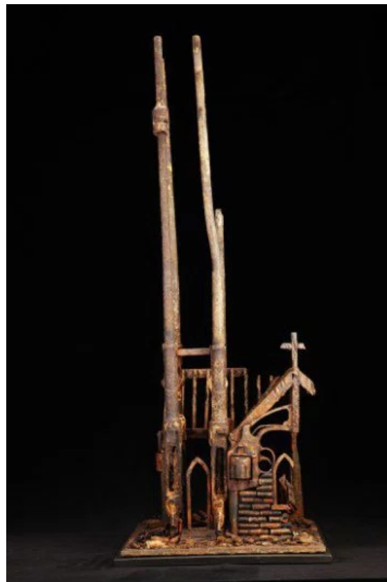
“Burnt Church” by Al Farrow

There is one piece in particular that both Stites and Farrow wanted in the Louisville exhibit. It’s of a burned church where only fragments of the facade remain. Although it was patterned after a European church destroyed in a war, Stites says it resonates with the South due to the destruction of churches here during the Civil Rights era.