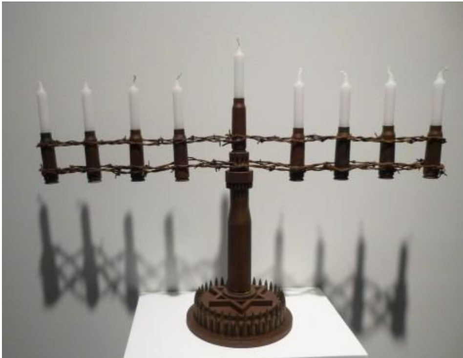
Menorah (Fence II)