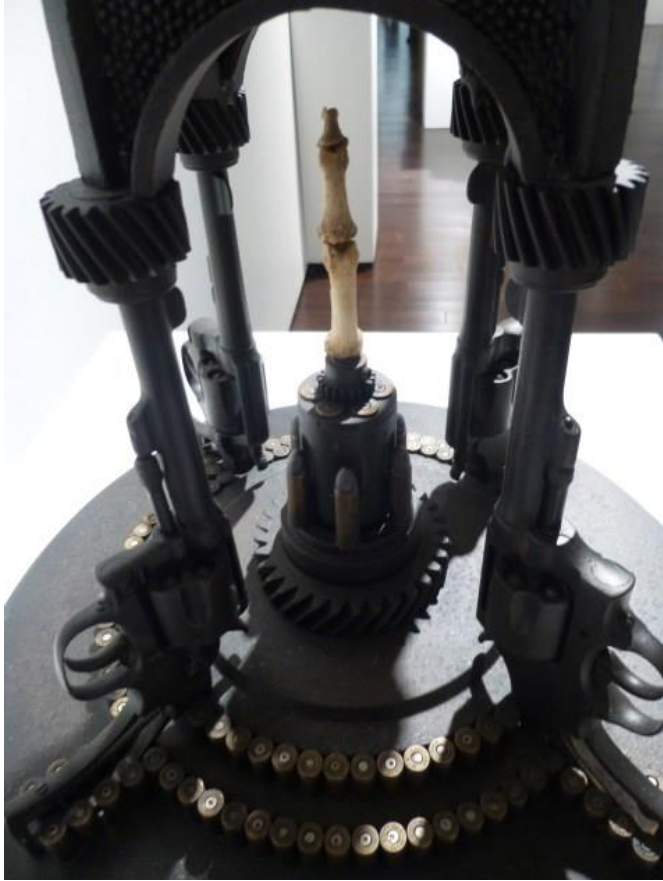
Trigger Finger of Santo Geurro (Detail)