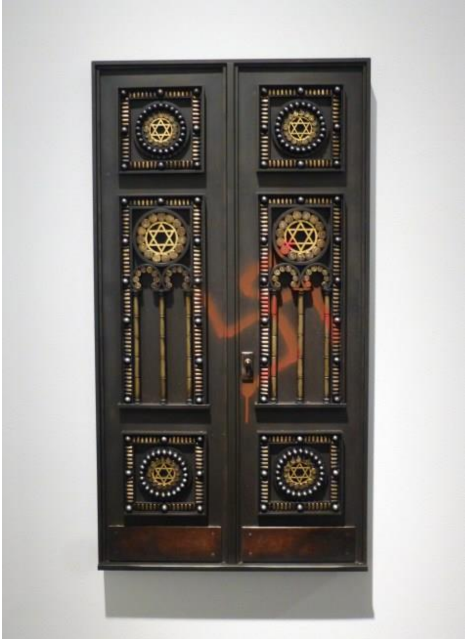
Vandalized Synagogue Door (I)