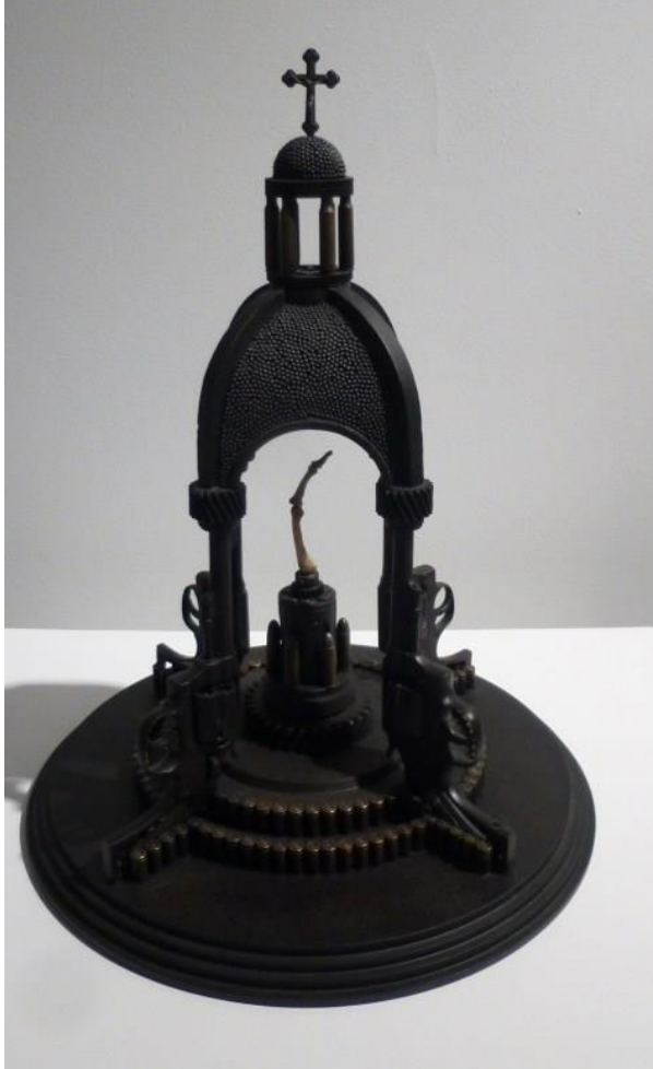
Trigger Finger of Santo Geurro (Guns, Bullets, Bullet Shells, Steel, Bone)

Farrow makes art not about a certain religion, but about the repetition of history, the inexorable battle of mankind, and the perversion of organized religion as a whole.