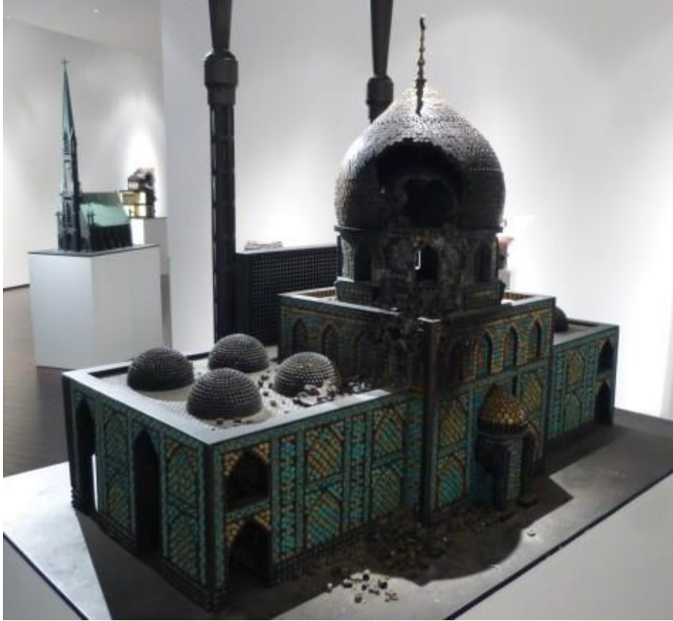
Bombed Mosque (Back)