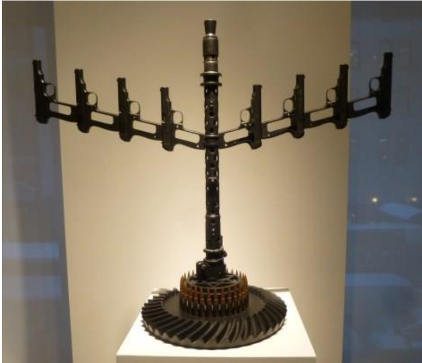
Menorah (Guns, Gun Parts, Steel, Bullets)

A Menorah , crafted from barbed wire and machine gun shells, is clearly layered with meaning and reference, but is an object of great reverence as well, attuned to past and present while statuesque and compelling in its presence.