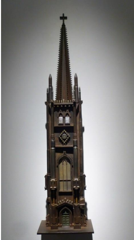
Sketch Of Trinity Church

Sacred and profane, metaphoric and literal, gleaming and shocking, Al Farrow's Wrath & Reverence is unforgettable and deeply moving.