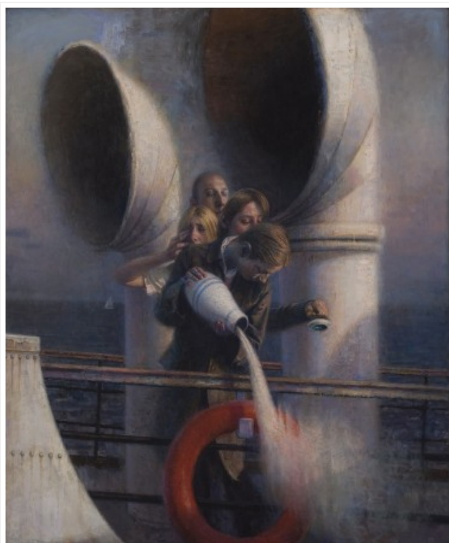
Paul Fenniak Offshore 2011

"It's not so much what you depict but how you depict it." Paul Fenniak