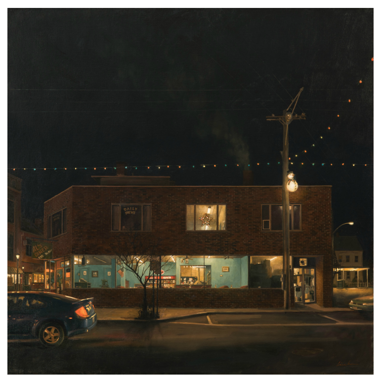
Takeout, 2016, oil on canvas, 36 x 36 inches, Courtesy of the artist