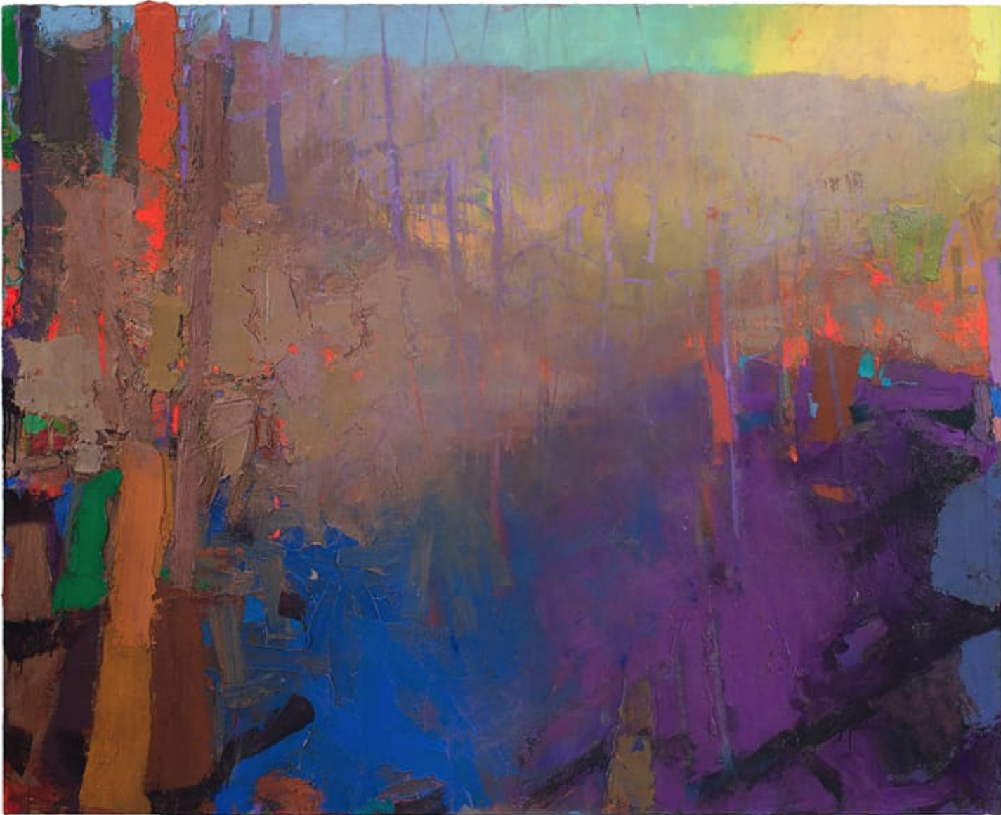
Wax Myrtle, 2015, 55x68in, oil on linen