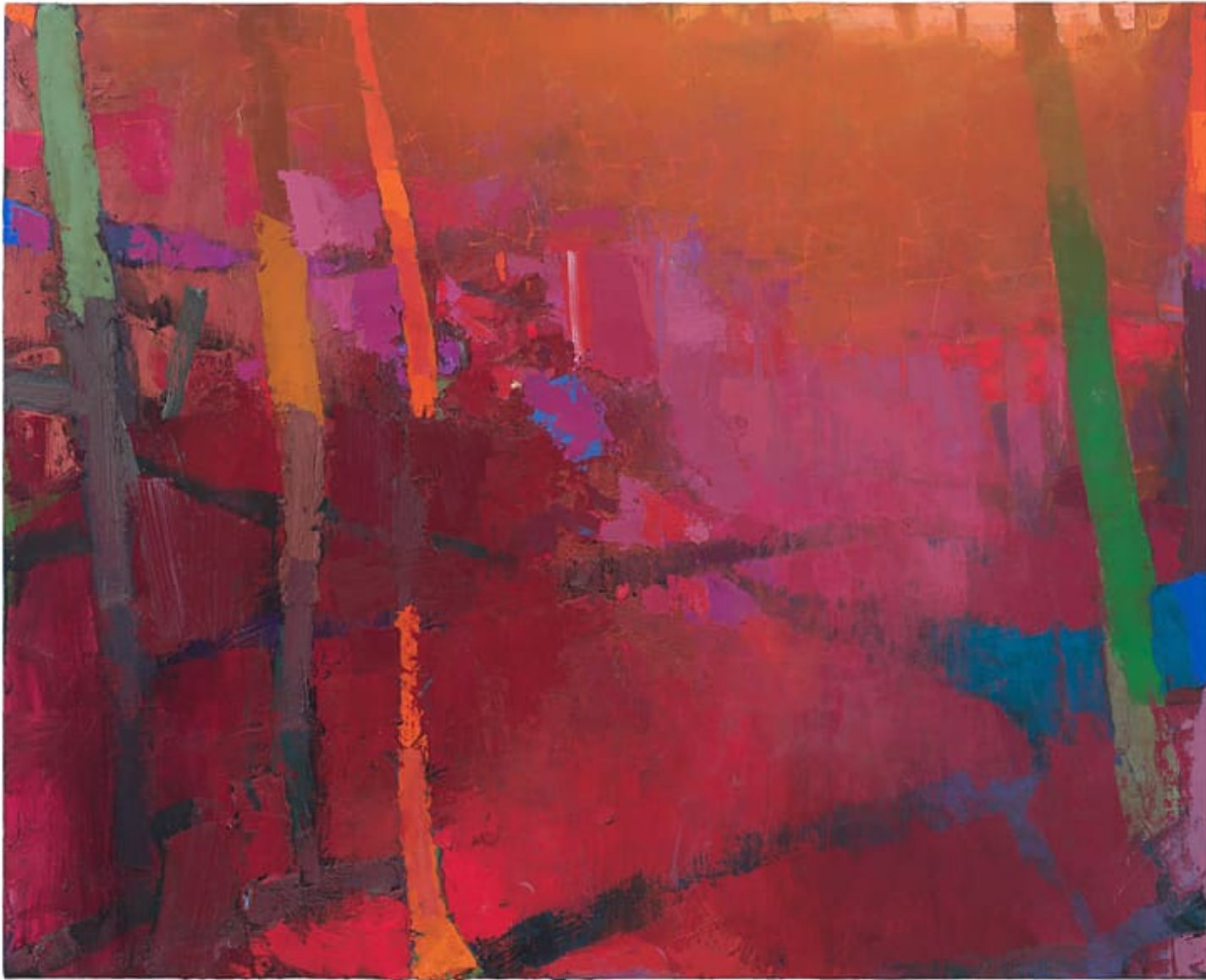
Inkberry, 2015, 55x68in, oil on linen