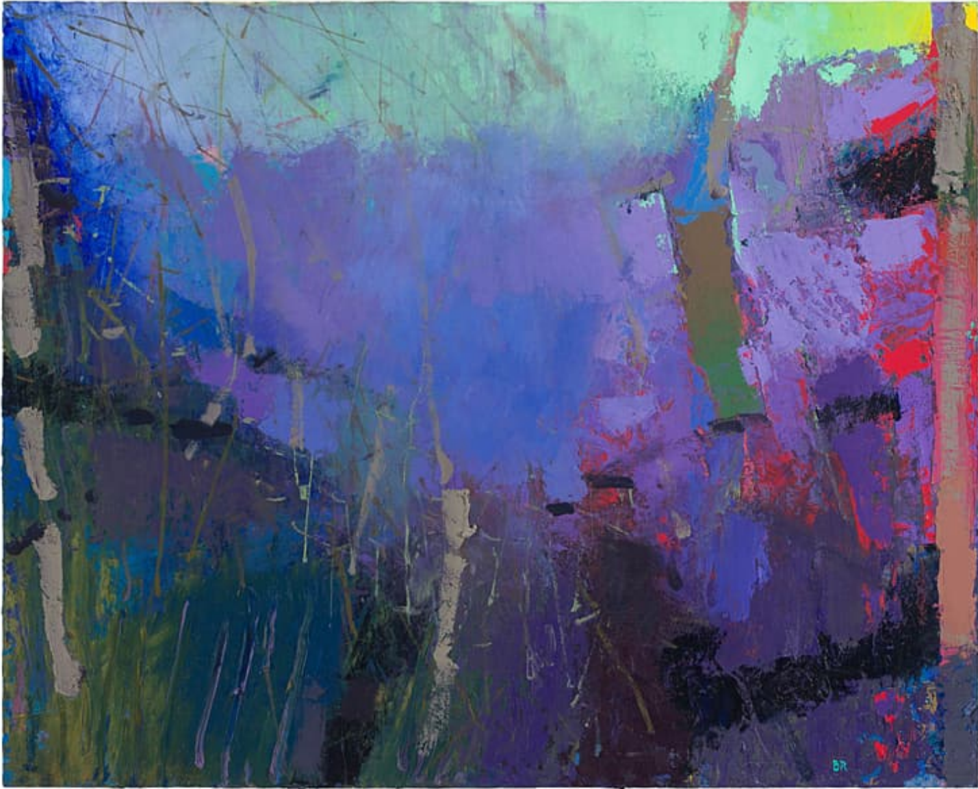
Greenfield, 2016, 55x68in, oil