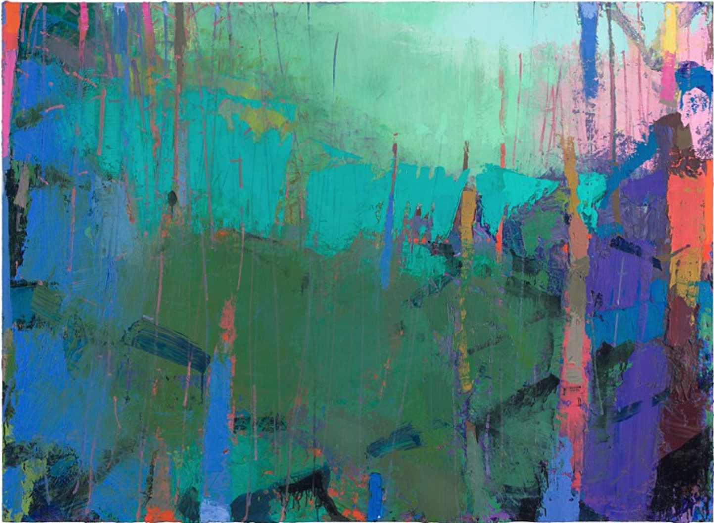
Fronde, 2016, 60x82in, oil