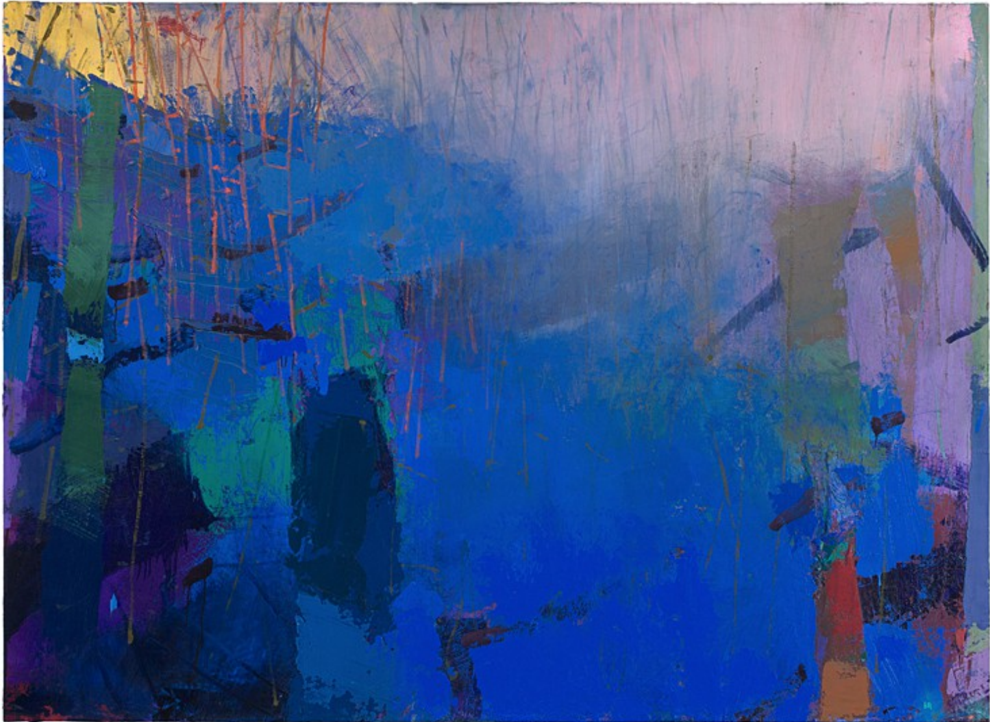
Flying Point, 2016, 60x82in, ol