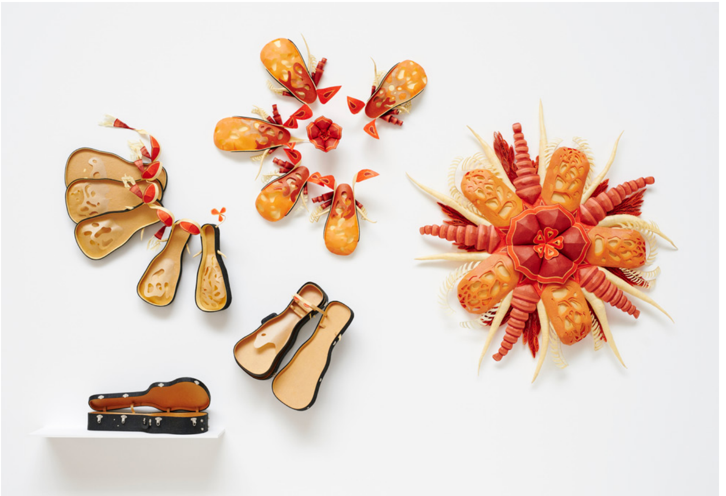
You Know That Place. Paper. 30 x 40 x 4 in.