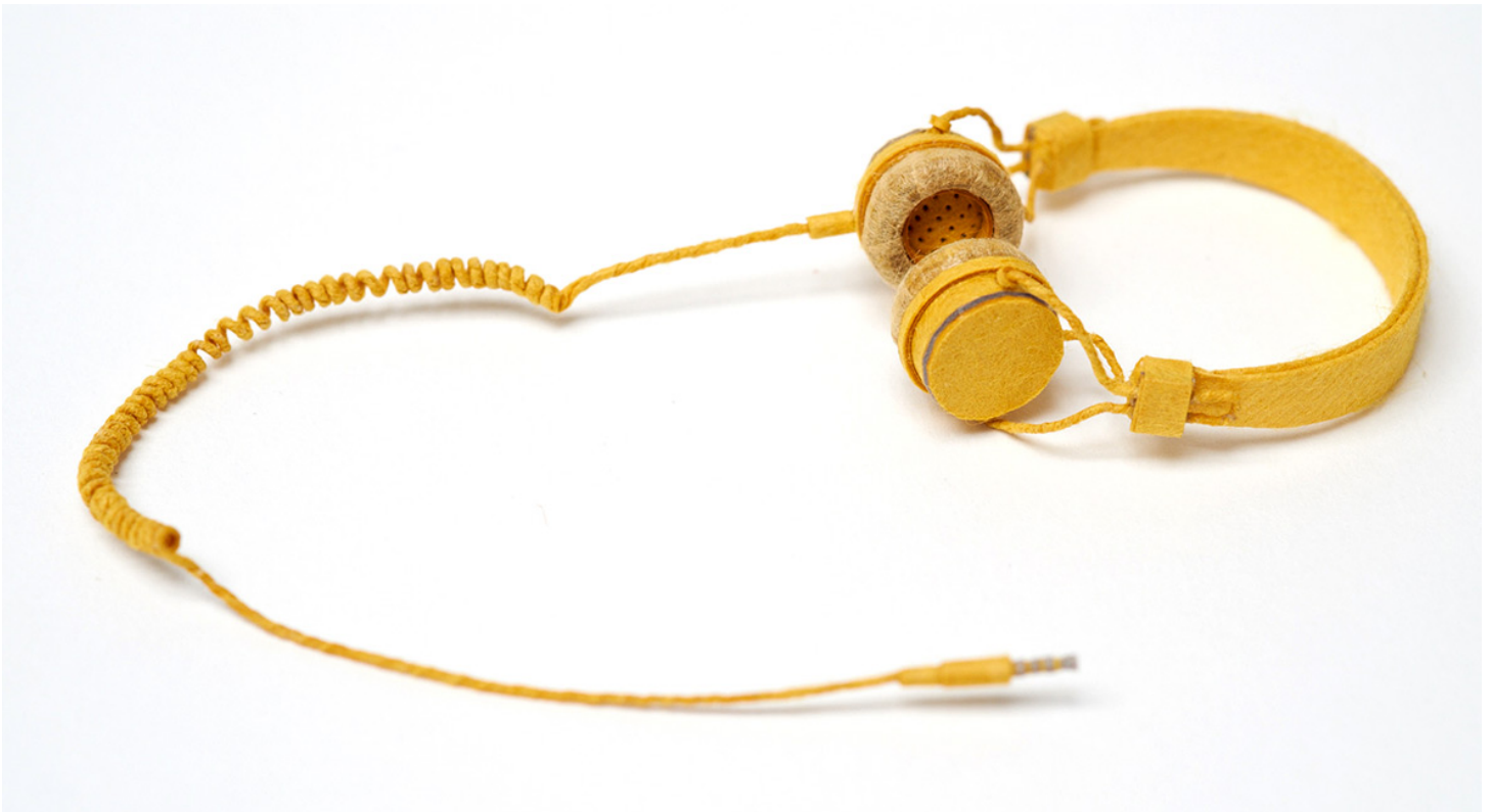
I Thought They Worked Better. Detail.