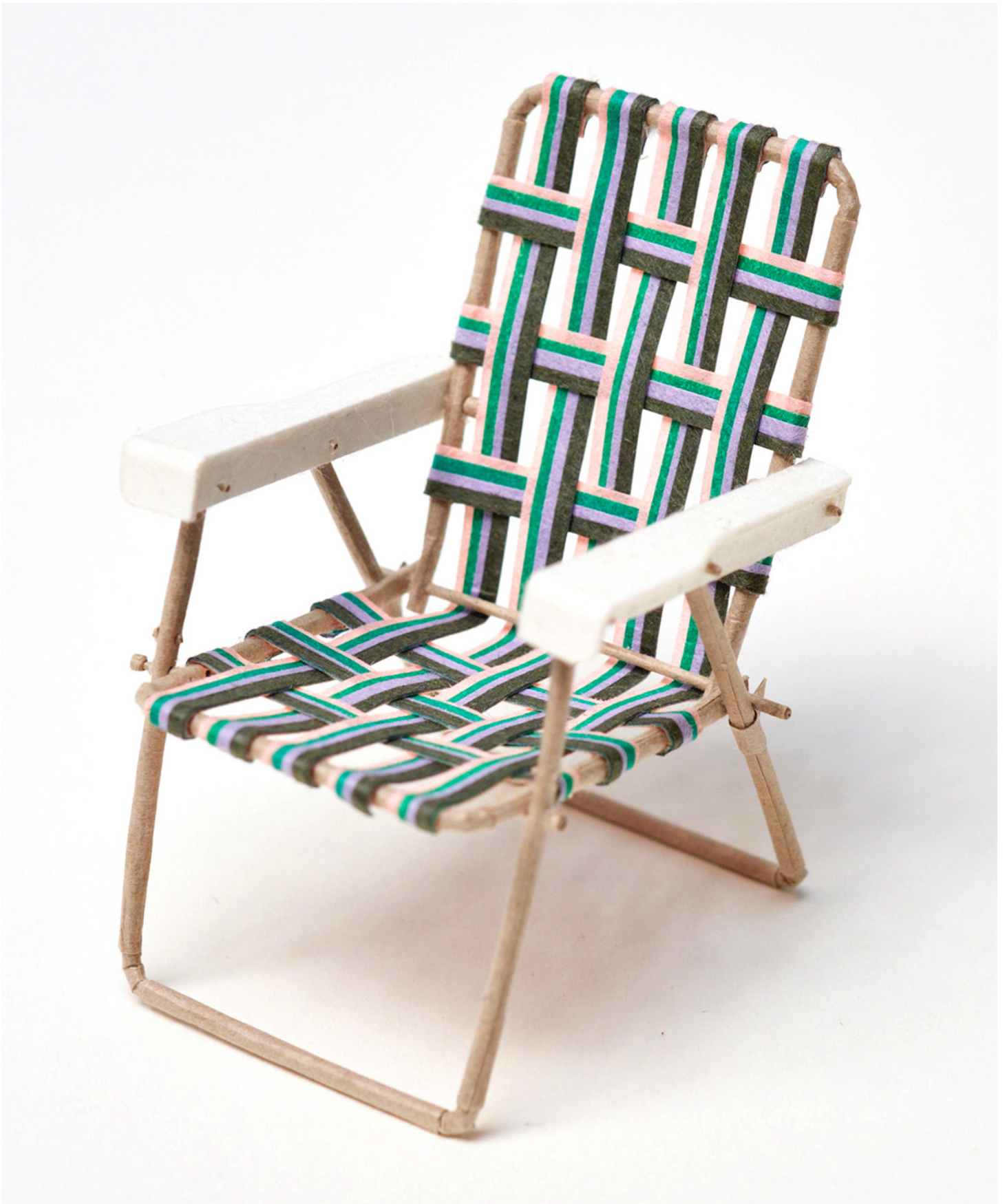
I Was Thinking of Something Else. Detail.