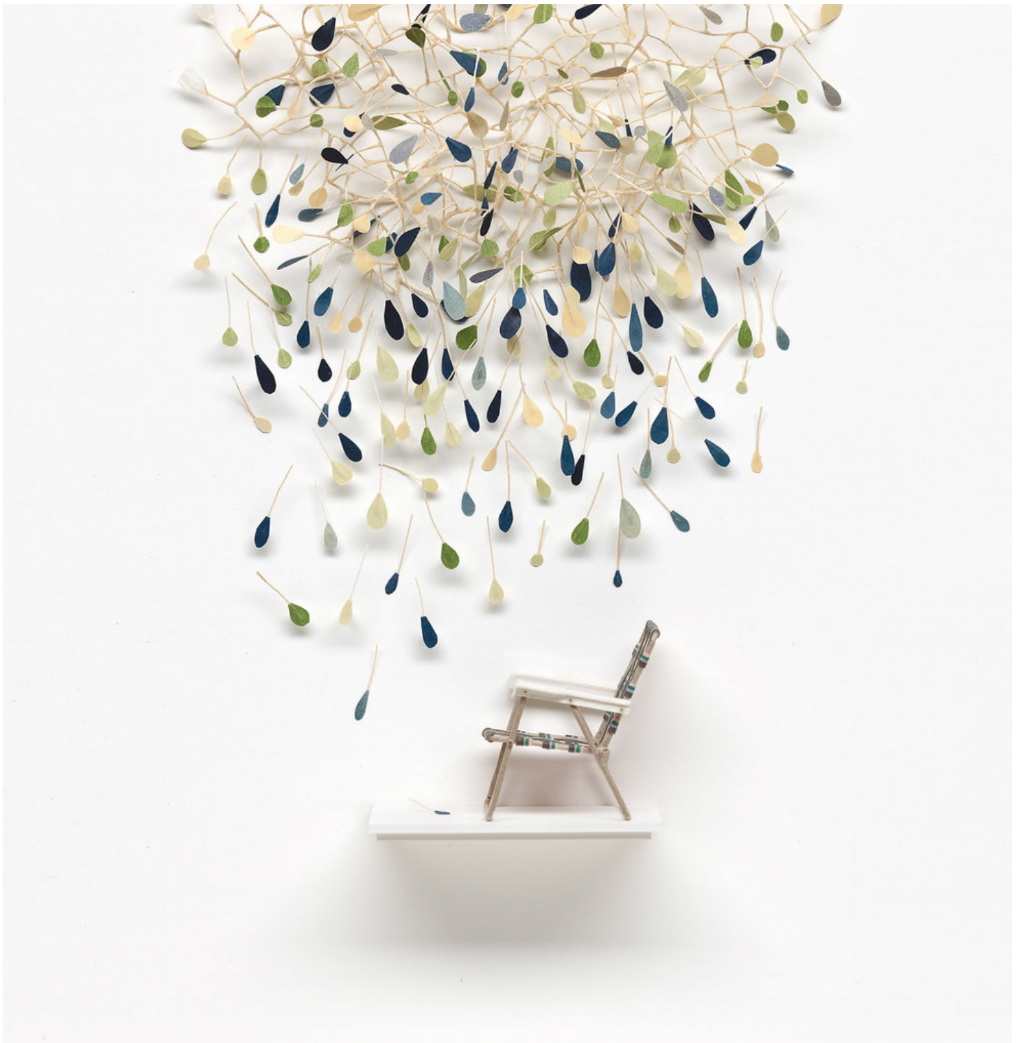
I Was Thinking of Something Else. Paper lawn chair, leaves. 17 x 24 x 3 in.