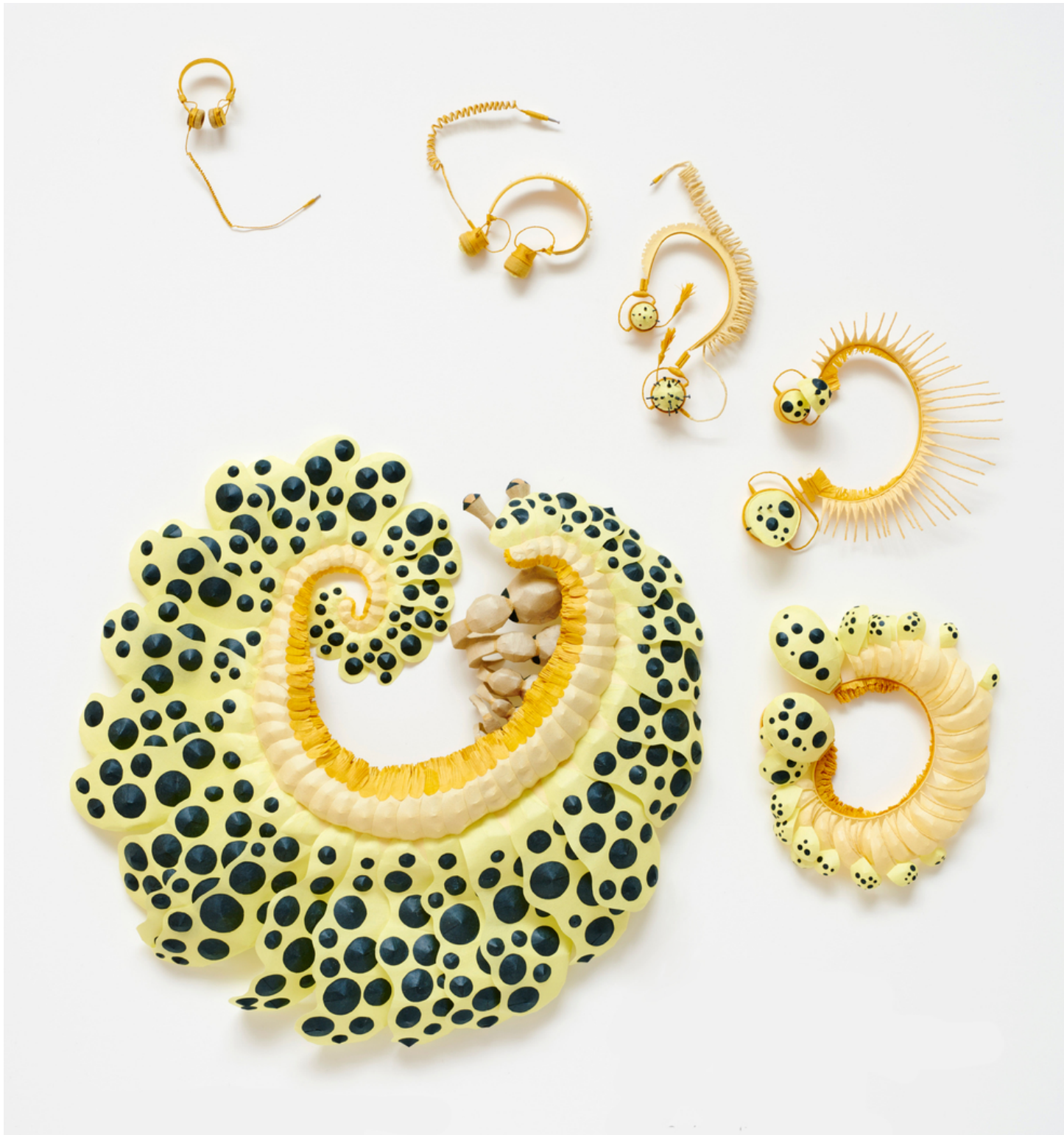
I Thought They Worked Better. Paper. 33 x 28 x 2.5 in.