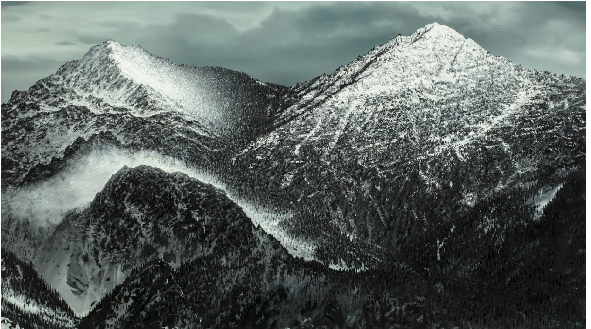
Its Meaning Has Shifted, 2019, oil on canvas, 58 x 98 inches