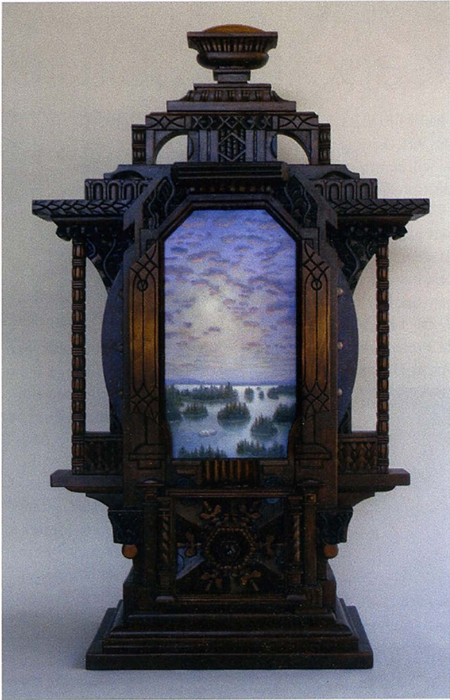
The Enlargment , 2017, acrylic on carved wood, 31 1/2 x 19 3/8 x 7 1/4 inches