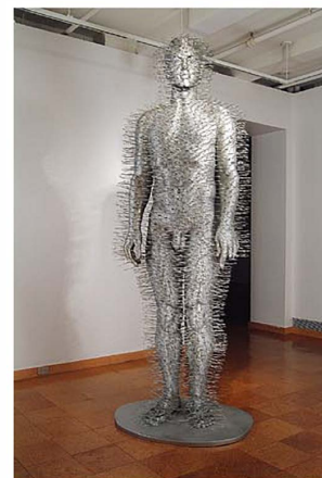
Straight Up (Coathanger Man) , 2004 wire coathangers 115 x 40 x 33 inches