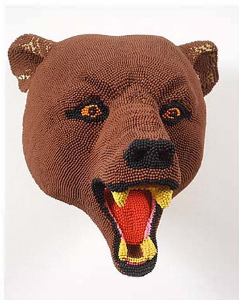
Brown Bear , 2003 wooden safety matches 17 x 16 x 16 inches

The standout, though, is a robust, rippling American flag put together from thousands of pictures of Pamela Anderson in her signature red "Baywatch" swimsuit. The cards have square holes in them, like old IBM punch-cards or Florida voting ballots. Titled "Tour of Duty," it's a winningly vulgar Betty Grable pinup for our current flag-waving time of war.