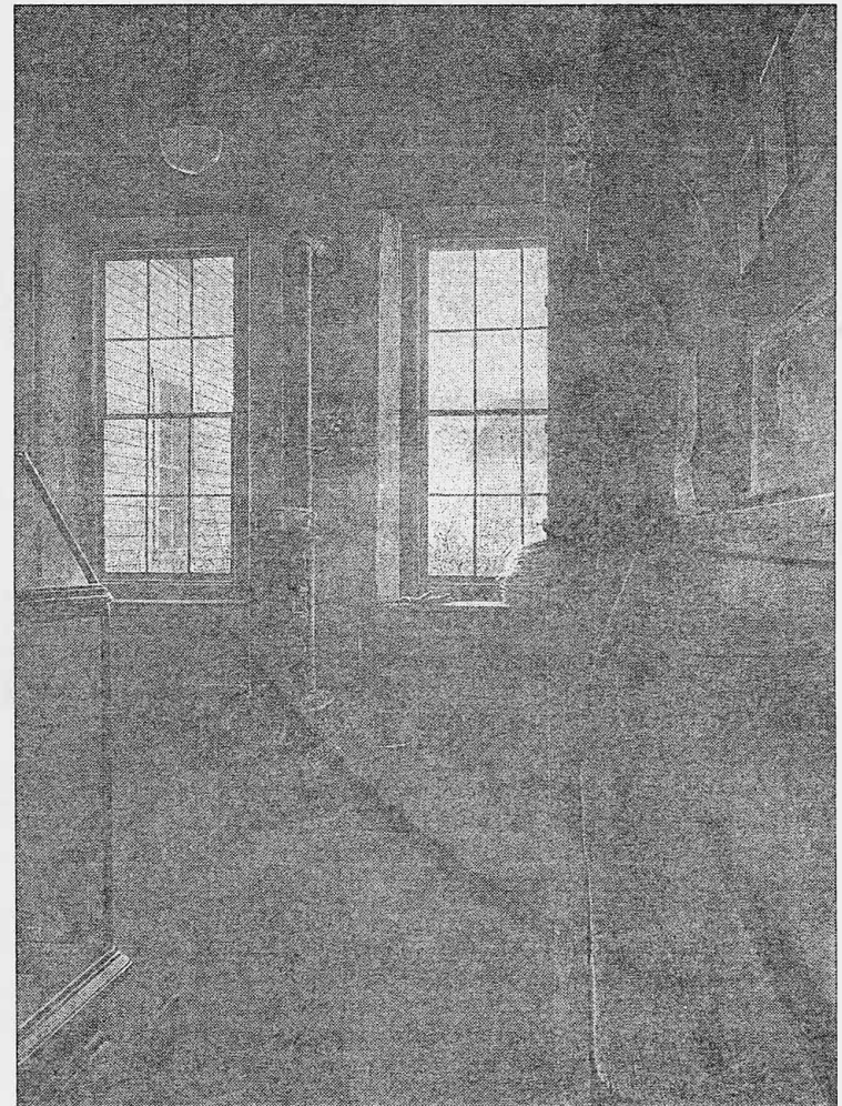
"Ned's Cigar Store," 1972, egg tempera on masonite.

Magee's works can be seen in public collections including The Fine Arts Museums of San Francisco, The Portland Museum of Art, the Farnsworth