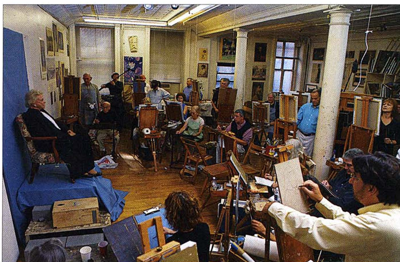
Retired Supreme Court justice Sandra Day O'Connor sitting for The Painting Group.