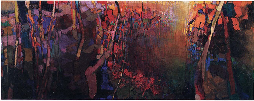
Carolina © Brian Rutenberg.