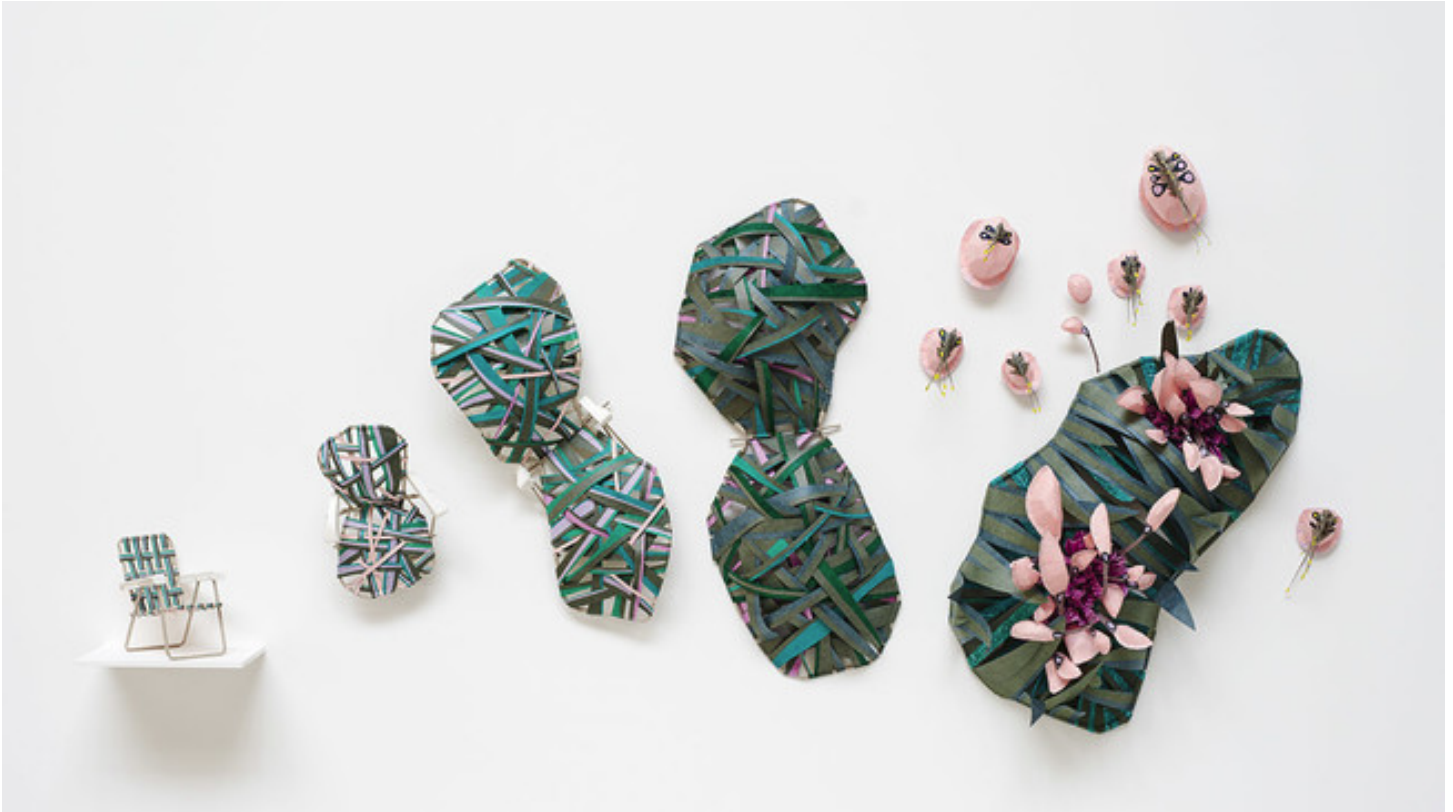
Cybèle Young, Courtesy of Forum Gallery, New York

Then, in steps, the objects begin to grow and transform, getting bigger, weirder, and messier, and taking on organic shapes until they look like strange sea creatures or fungi.