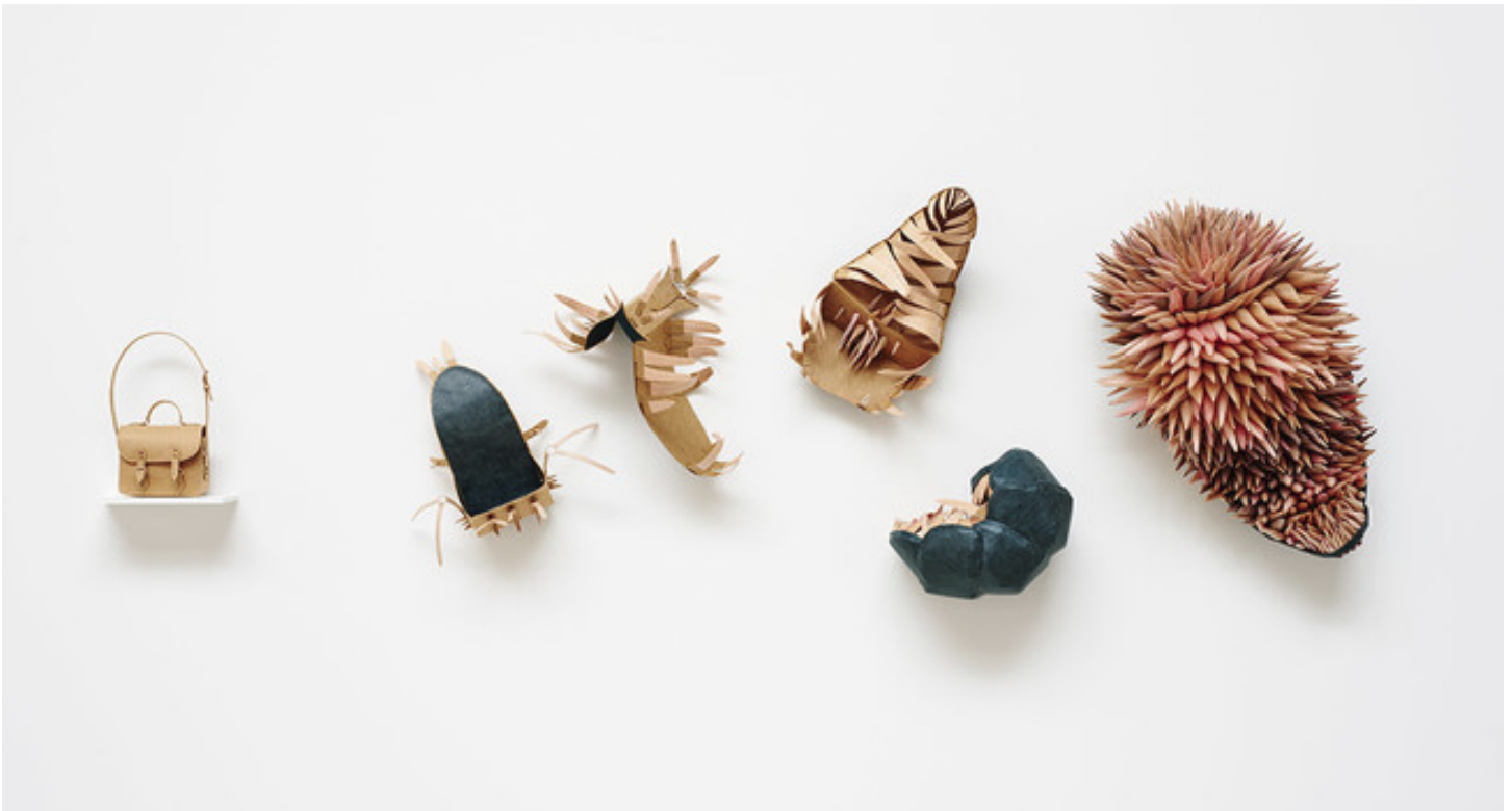
Cybèle Young