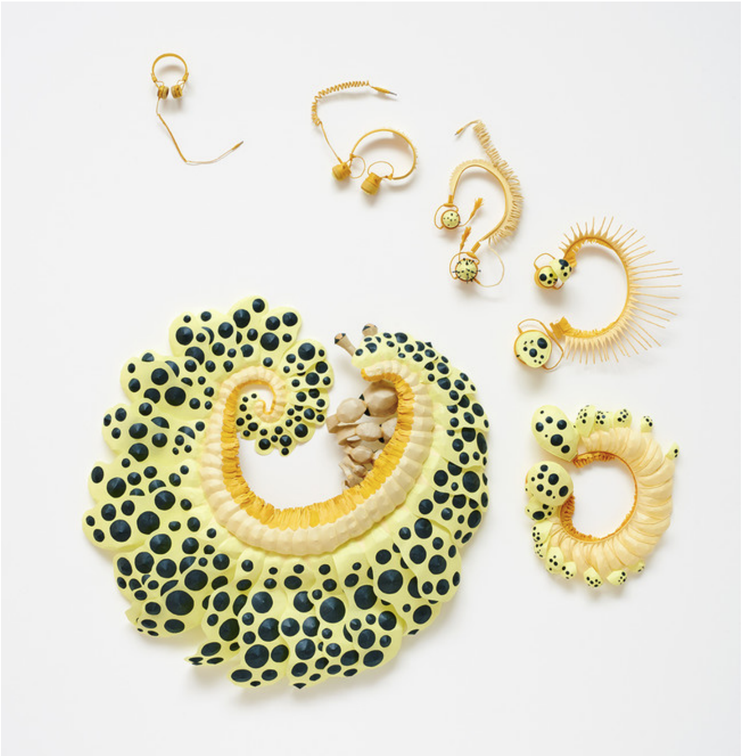
Cybèle Young