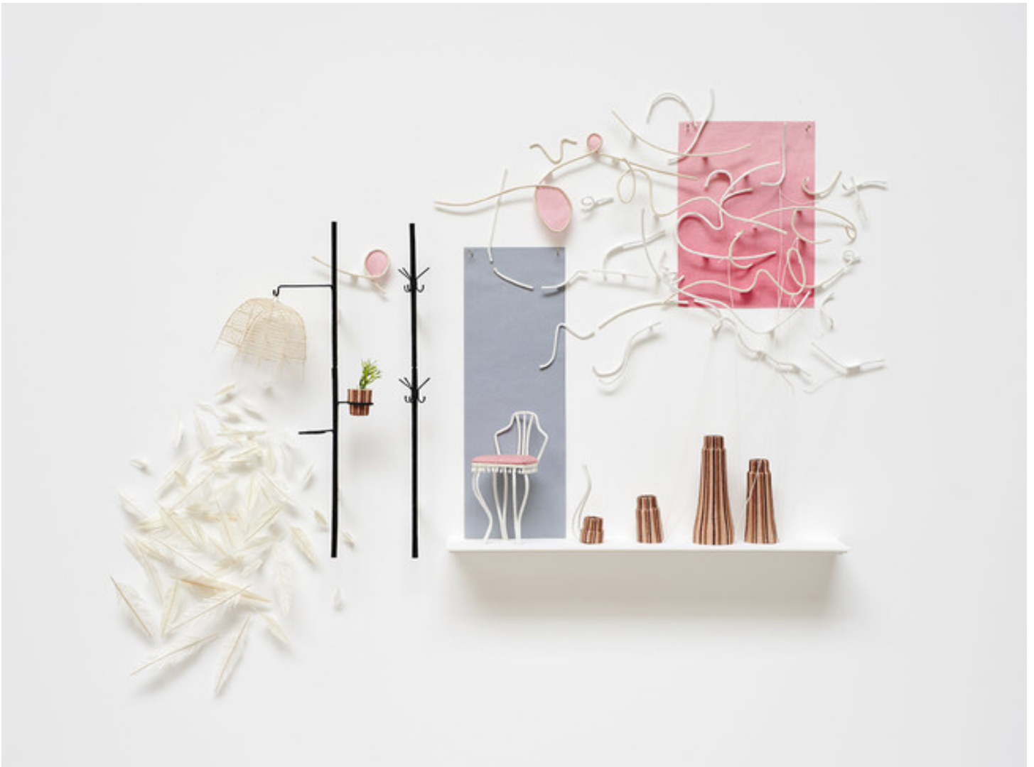
Cybèle Young