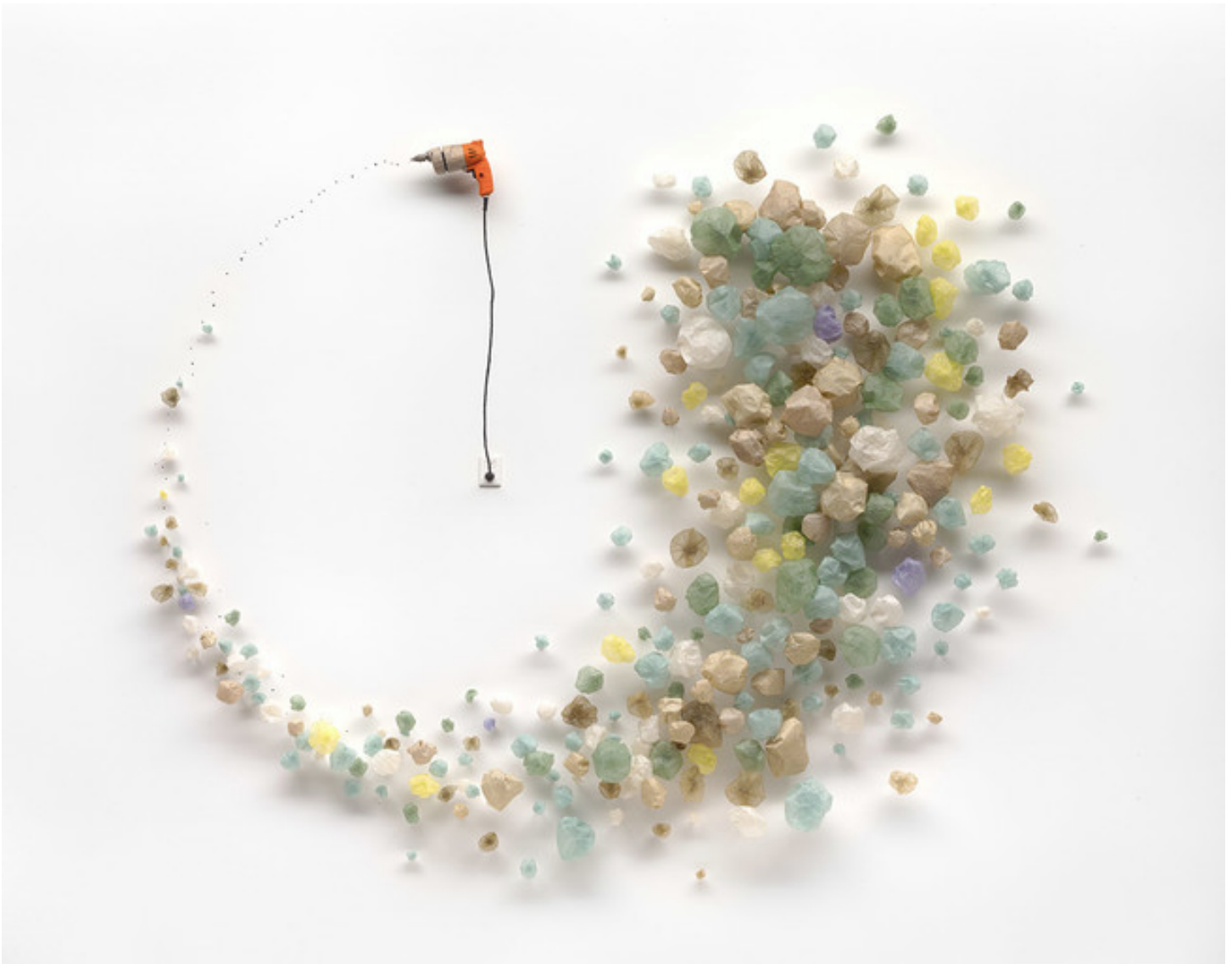
Cybèle Young