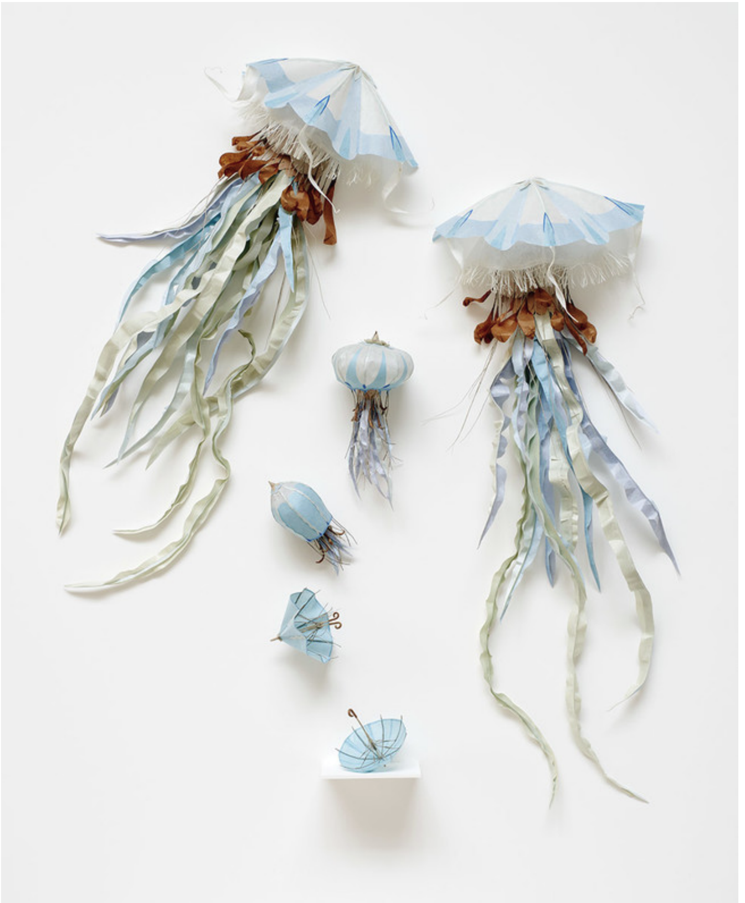
Cybèle Young