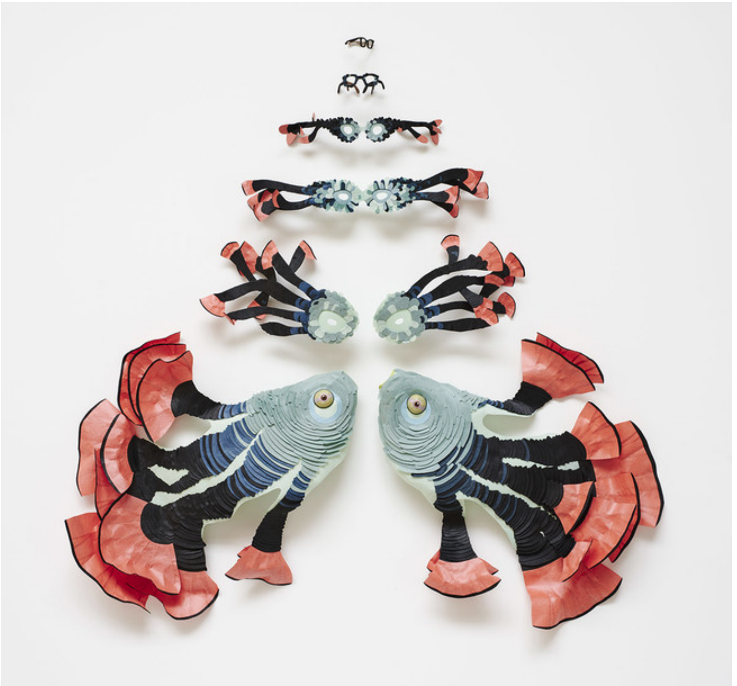
Cybèle Young, Courtesy of Forum Gallery, New York

It Came with Me Everywhere (Lost - satchel)