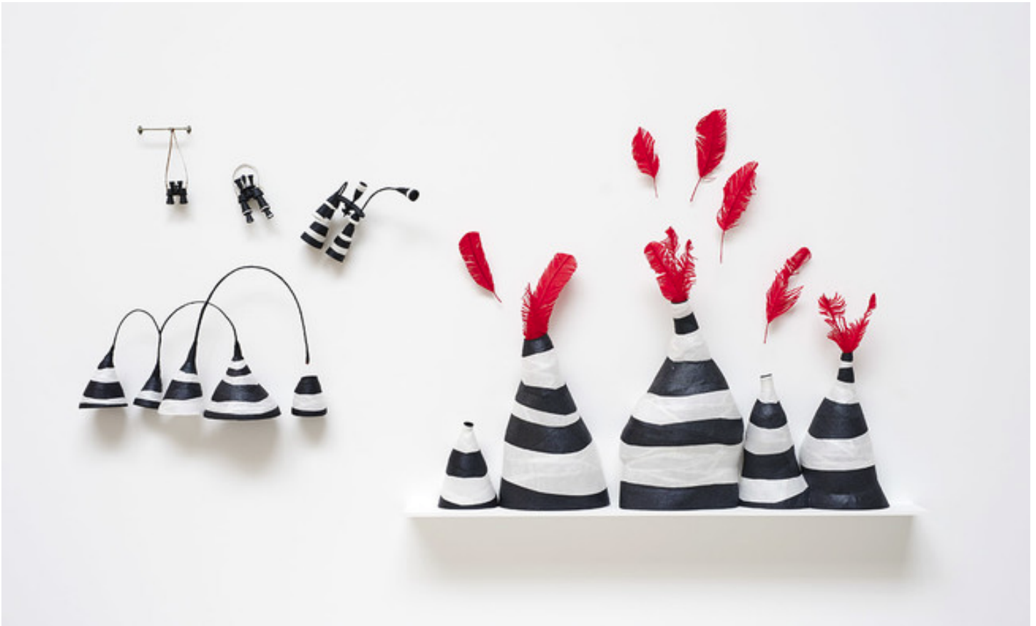
Cybèle Young, Courtesy of Forum Gallery, New York