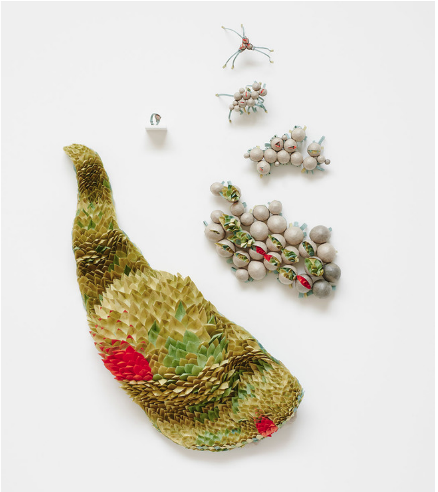
Cybèle Young, Courtesy of Forum Gallery, New York

How Does It Look for Tomorrow? (Lost - umbrella)