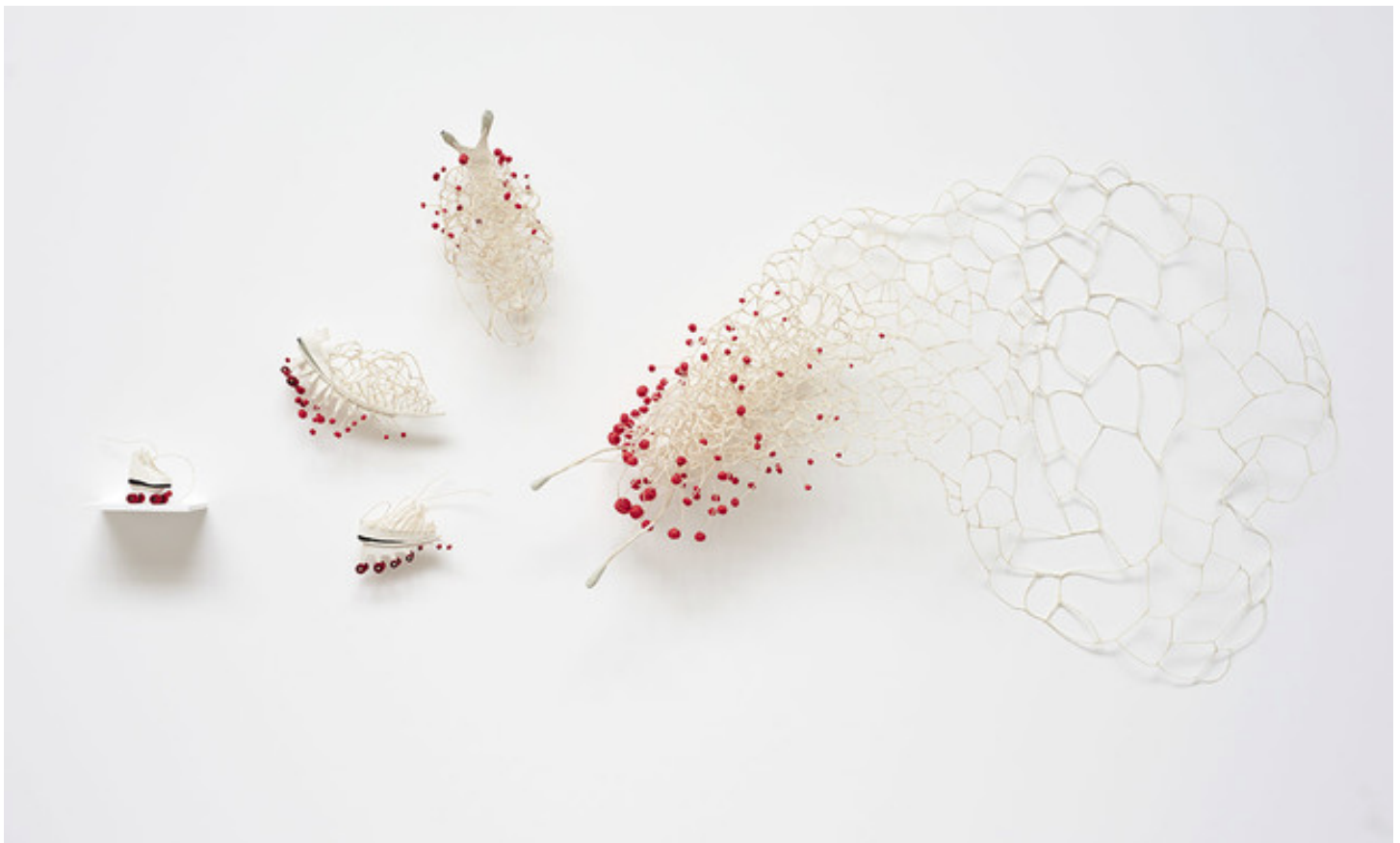
Cybele Young