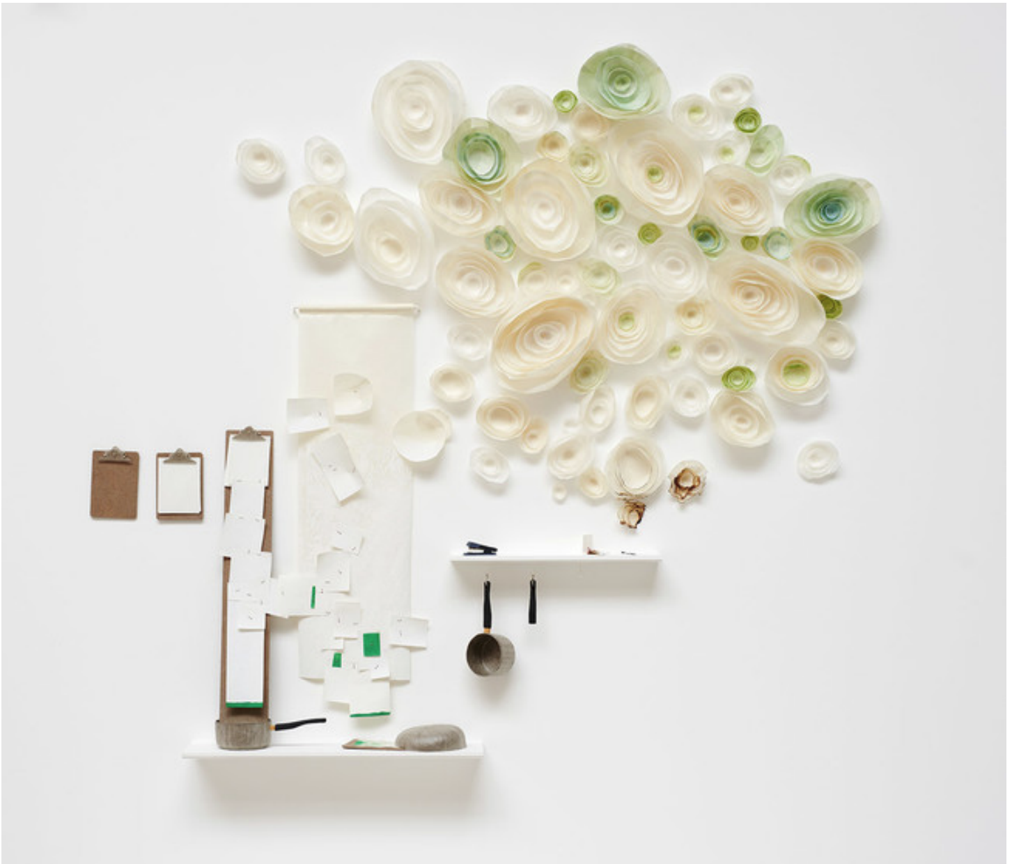
Cybèle Young, Courtesy of Forum Gallery, New York

Young's paper sculptures also show everyday items in strange worlds, where they're not necessarily transforming, but their everyday, expected uses are still being subverted into strange, surreal new scenes.