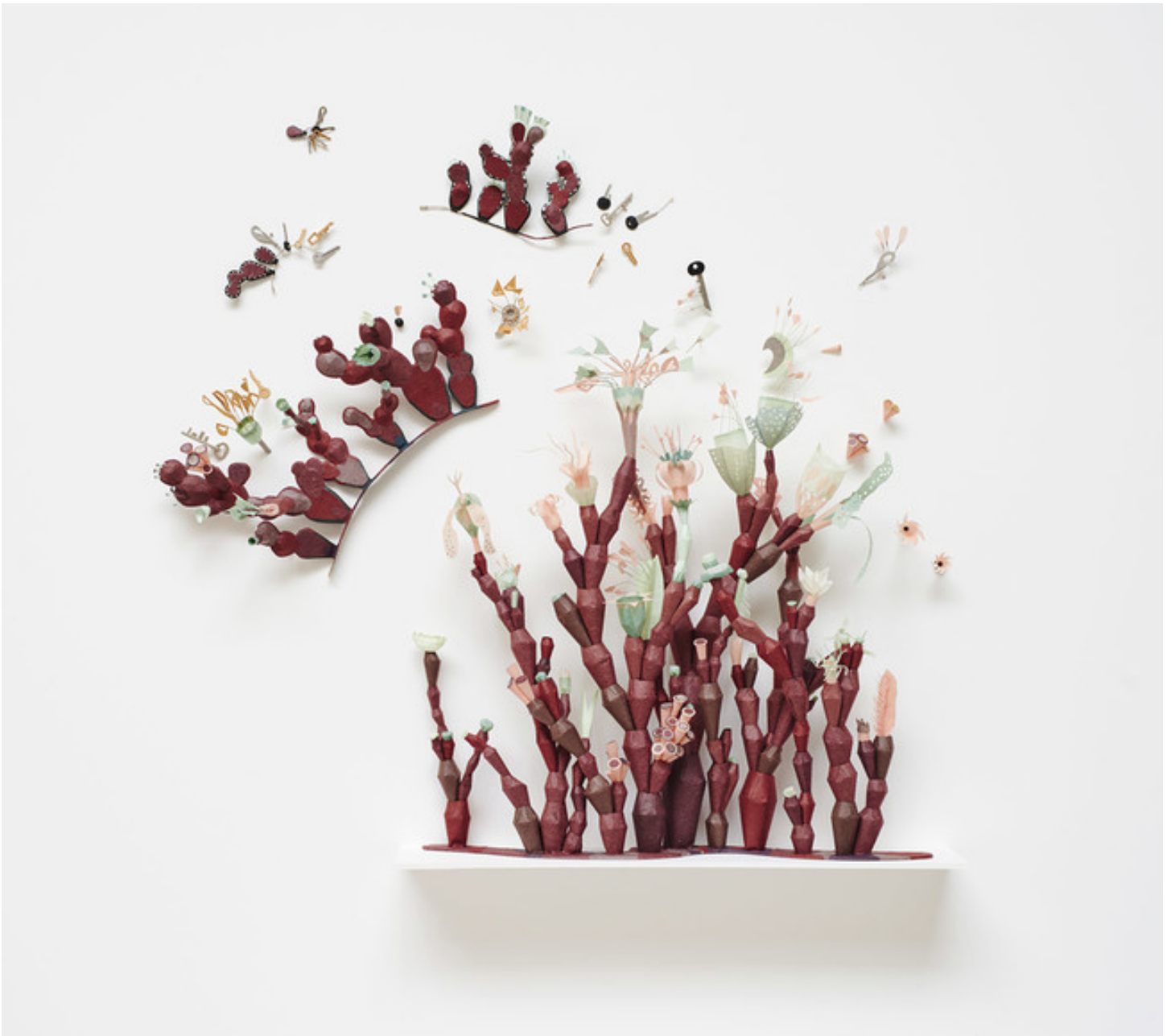
Cybèle Young

It's almost like the imagined world of what these objects get up to when no one is around.