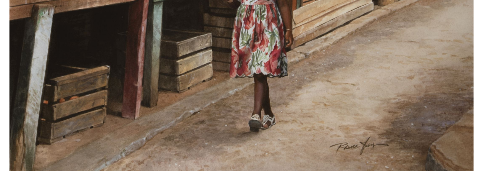
Anthem, 2018