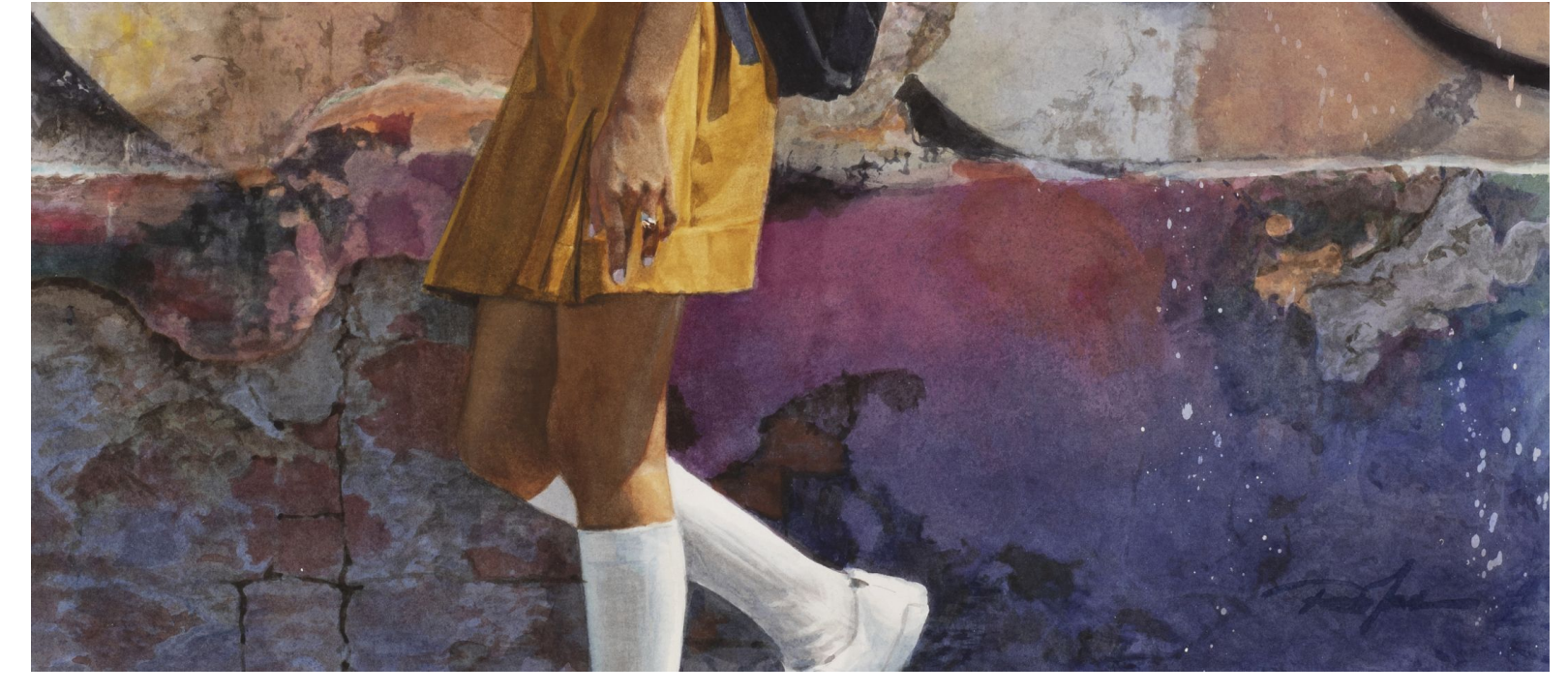
Angel, 2020