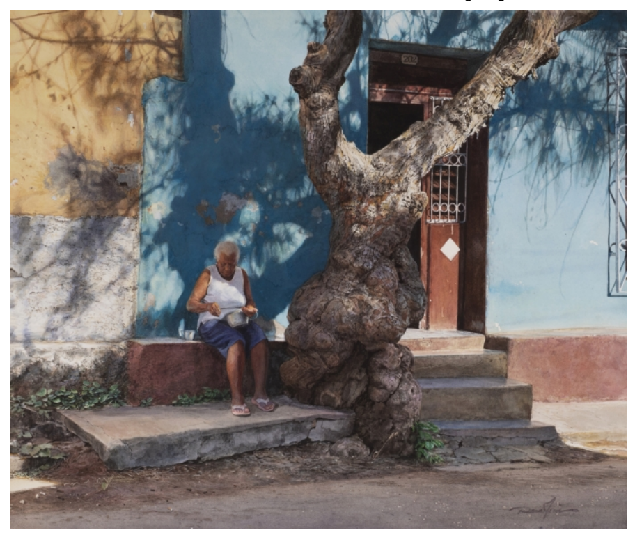
Rance Jones, "Meditation," 2019, watercolor on paper, 21 x 25 in.

In the twenty-six watercolors that comprise the exhibition, "A Lingering Revolution," Jones explores children, farmers, workers, shoppers and tradespeople against the remarkable past/present landscape that is Cuba today.