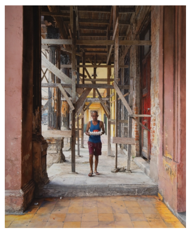
Rance Jones, "Iglesia de Castro," 2019, watercolor on paper, 38 \times 30 in.

In the twenty-six watercolors that comprise the exhibition, "A Lingering Revolution," Jones explores children, farmers, workers, shoppers and tradespeople against the remarkable past/present landscape that is Cuba today.