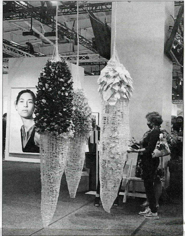
View of Works on Paper Fair.