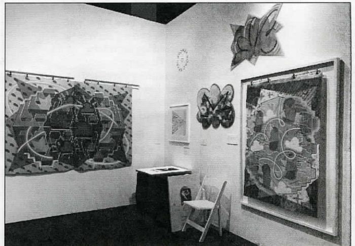
Stoney Road Press, Works on Paper Fair.