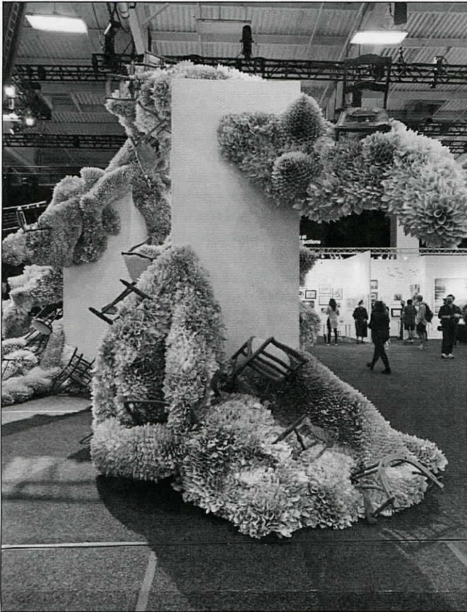
Permutation 3 by Samuelle Green at Works on Paper Fair.

this time was Samuelle Green's Permutation 3 made from hundreds, if not thousands, of curled pages from books affixed together in an organically shaped accumulation spanning three interior columns and stretching itself across their span, allowing fair-goers to wander between and beneath the delicate, yet imposing masses. These sculptures made excellent use of paper as a sculptural medium, giving attendees a reminder that "works on paper" can mean more than traditional two-dimensional works.