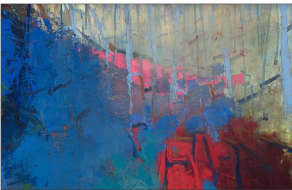
Tempest Tells Me, 2023 oil on linen, 53 x 68 in. by Brian Rutenberg.