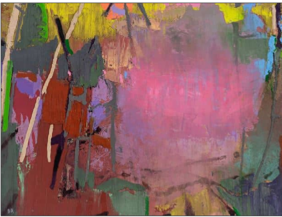
River Diver 7, 2023 oil on paper, 23 x 30 in. by Brian Rutenberg.

Indeed, with their exhilarating vibrancy and luminous clarity, these paintings have the remarkable capacity to feel as though the visual equivalence of the joy of being in nature has been achieved.