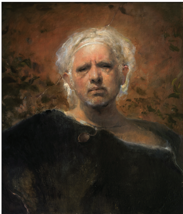
Odd Nerdrum, Black Fur , n.d., oil on canvas, 29½" x 25½". Forum.

The works of Norwegian painter Odd Nerdrum have always raised questions about art and philosophy. This impressive show of 13 large oil paintings (all undated) was no exception. A master of classical technique, Nerdrum often adopts the loose brushwork of Rembrandt, and, like his 17th-century predecessor, Nerdrum loves self-portraits, chiaroscuro lighting, and flamboyant costumes. In Arcadia