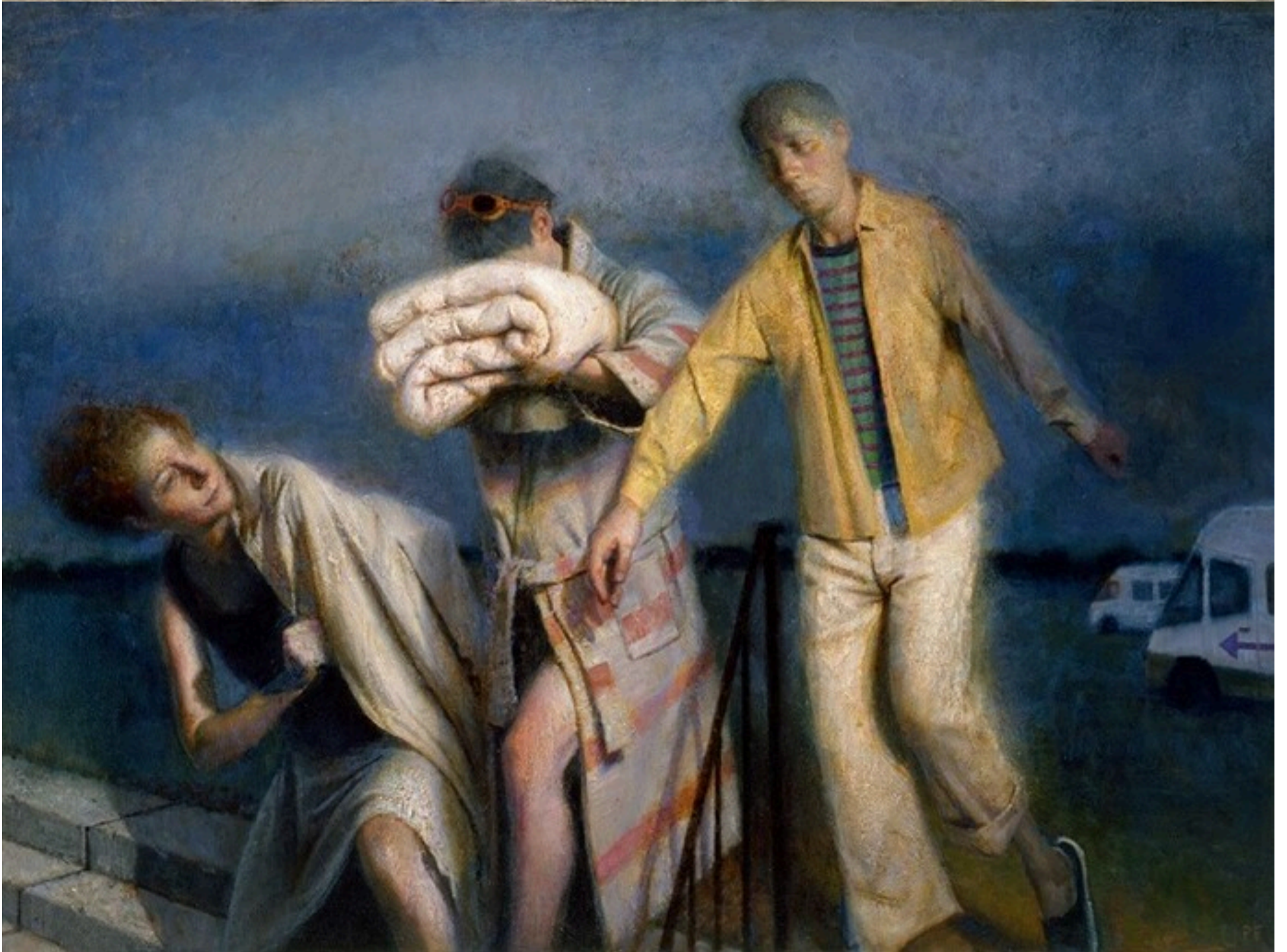
1. Guillermo Muñoz Vera, Olives of the Mediterranean , 2020.