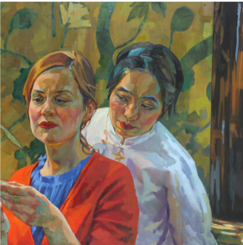
Xenia Hausner 14 Nov 2019 — 11 Jan 2020