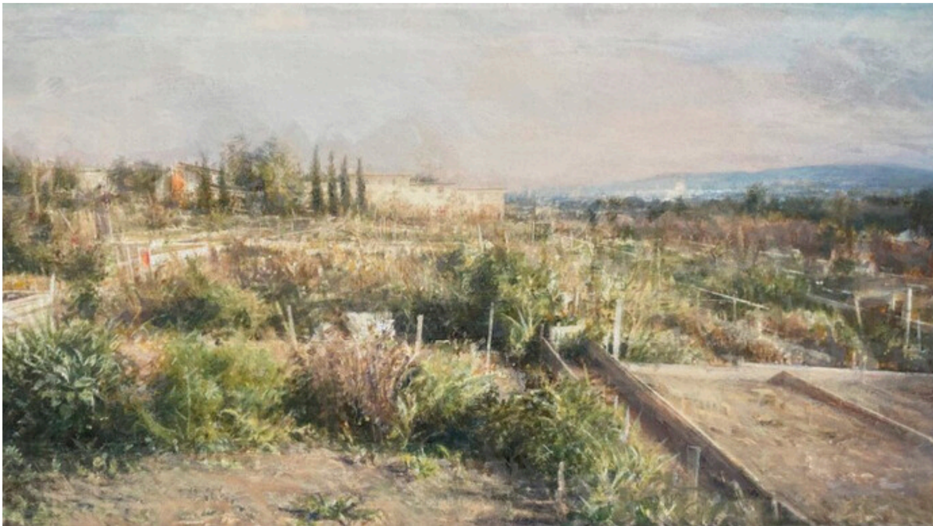
Robert Bauer, Gardens, Santa Monica, 2022.

Beginning July 25, 2024, Forum Gallery presents Out of town , an exhibition about the human desire to escape our busy urban lives for the reverie of landscape vistas and seasonal adventures. By the hand of a diverse selection of visionary contemporary and twentieth-century artists, the twenty-nine paintings, works on paper, and textiles comprising the exhibition present visual interpretations of landscapes and nature's seasonal offerings inspired by natural subjects from coast-to-coast and faraway shores, as well as expressions of the artists' own personal introspection. Out of town continues through Saturday, September 7, 2024.