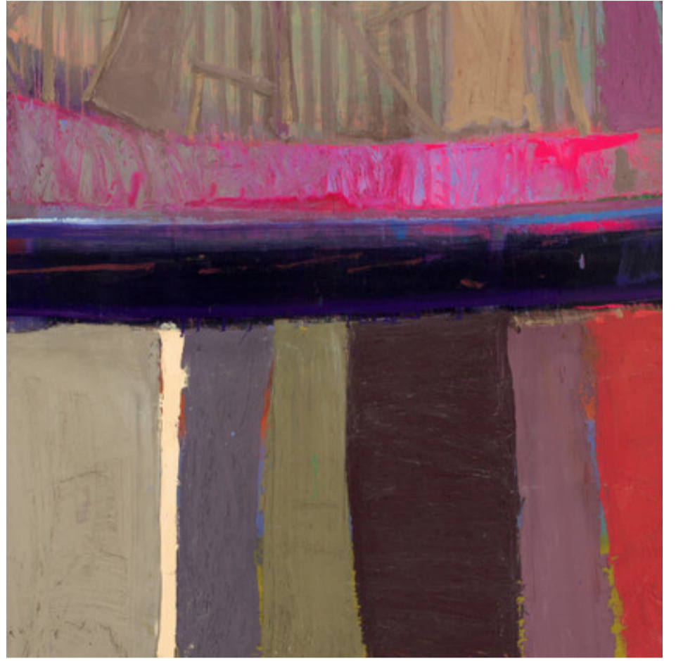
Brian Rutenberg 27 Feb — 25 Apr 2020