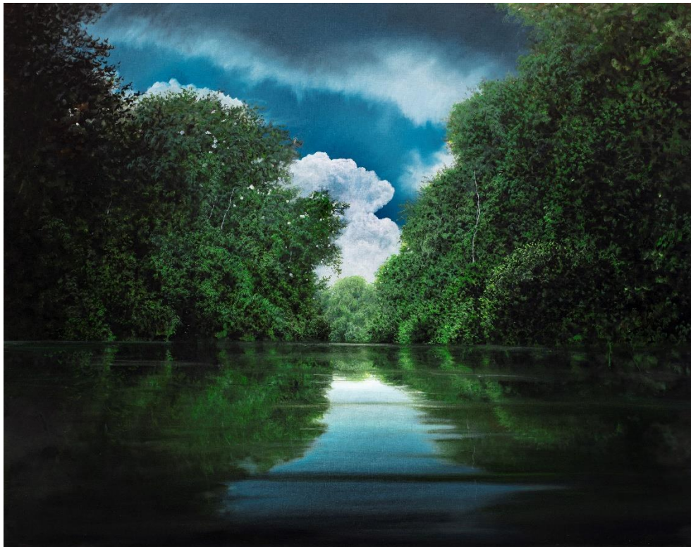
Oscillations of the Heart , 2019, oil on canvas, 60 x 76 inches

the place, but the sense of discovery, of wonder she felt as she found it. The lush warmth of sub-tropical rivers, the majestic power of snow-capped mountains, the peaceful silence of calm waters and the distinctive roar of waterfalls are the essential, natural phenomena on display in Telfair's paintings. The exceptional detail in her technique belies the imaginary nature of the subject as the medium scale of the works belies the expansive, majestic power of the landscape depicted. Throughout her career, Telfair has conceived all her landscape subjects from vivid imagination; Abrams books published a monograph on Tula Telfair's work entitled Invented Landscapes with essays by Henry Adams, J. Michael Fay and Michael Roth in 2016.