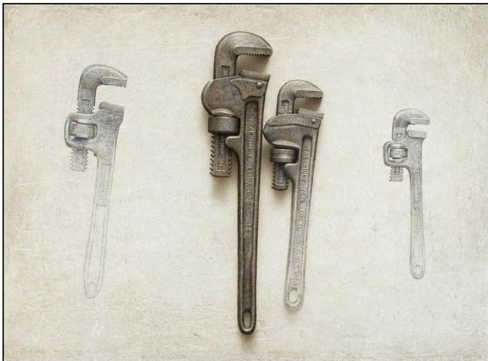
Alan Magee, Natural History , 1997, acrylic and oil on panel, 16 x 22 inches

Forum Gallery presents Natural History April 3 – May 31, 2019