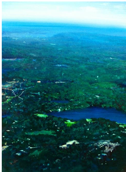
Remembered Landscape, 2022