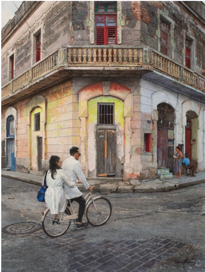
Calling , 2021, watercolor on paper, 32 x 25 inches