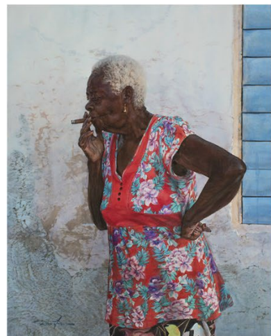
Fumando , 2022, watercolor on paper, 21 x 17 inches