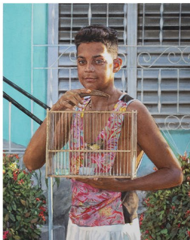
Close to the Heart , 2022, watercolor on paper, 12 ½ x 10 inches