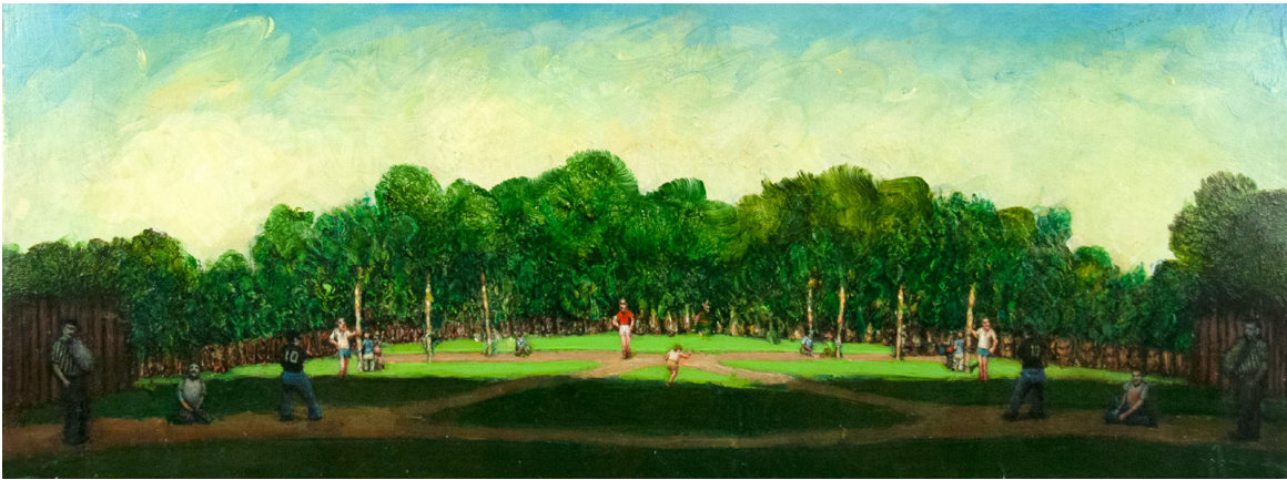
Gregory Gillespie, Lani's Game , 1999, oil on wood, 10 1/2 x 28 1/4 inches