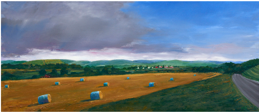
William Beckman, Bel Air Farm Summer , 2020, oil on panel, 9 3/4 x 23 3/4 inches