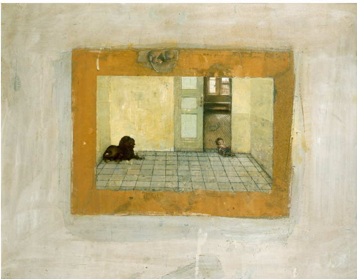
Gregory Gillespie, Dog and Doll in Room , 1981, mixed media, 25 x 31 inches