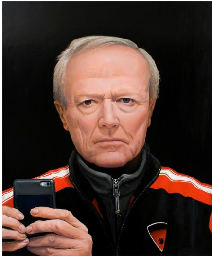
William Beckman, S.P. w/ I-P , 2019 oil on panel, 23 3/4 x 19 1/2 inches