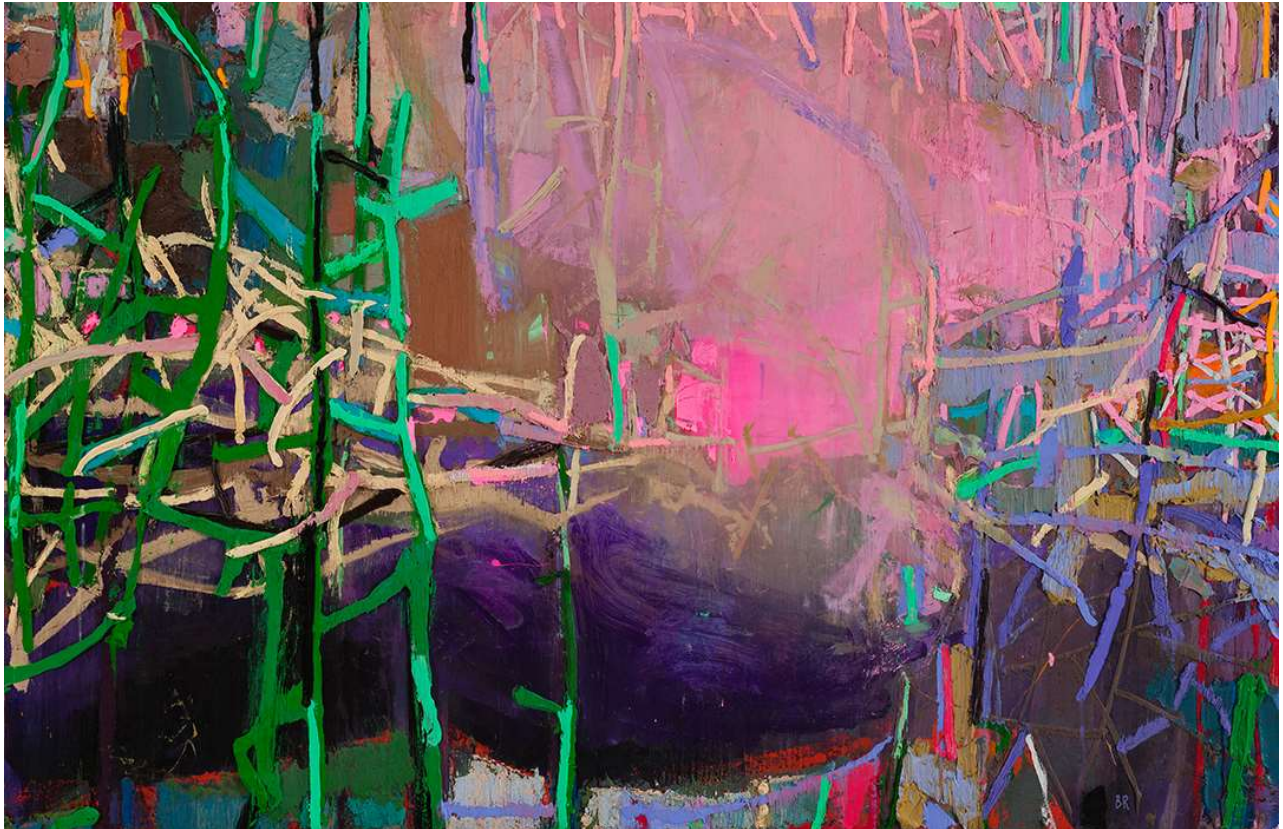
Brian Rutenberg, Pillow & Petal 6 , 2023, oil on linen, 36 x 55 inches

You are invited to explore our Online Viewing Room for Spring Forward here: viewingroom.forumgallery.com/viewing-room/spring-forward