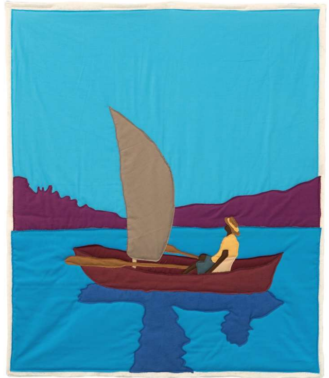
Michael C. Thorpe, Da Boat , 2022, textile, quilting cotton, and thread, 39 x 33 1/2 inches