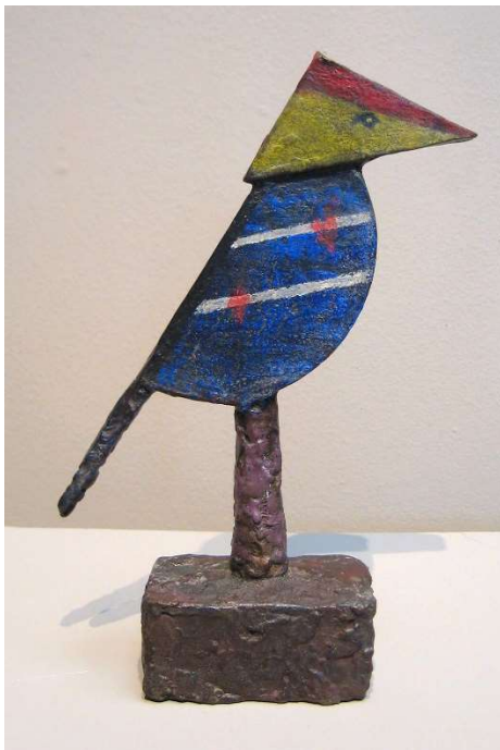
Max Weber, Colored Bird , 1960, bronze, 5 3/4 x 4 x 3 inches, Edition 6/6